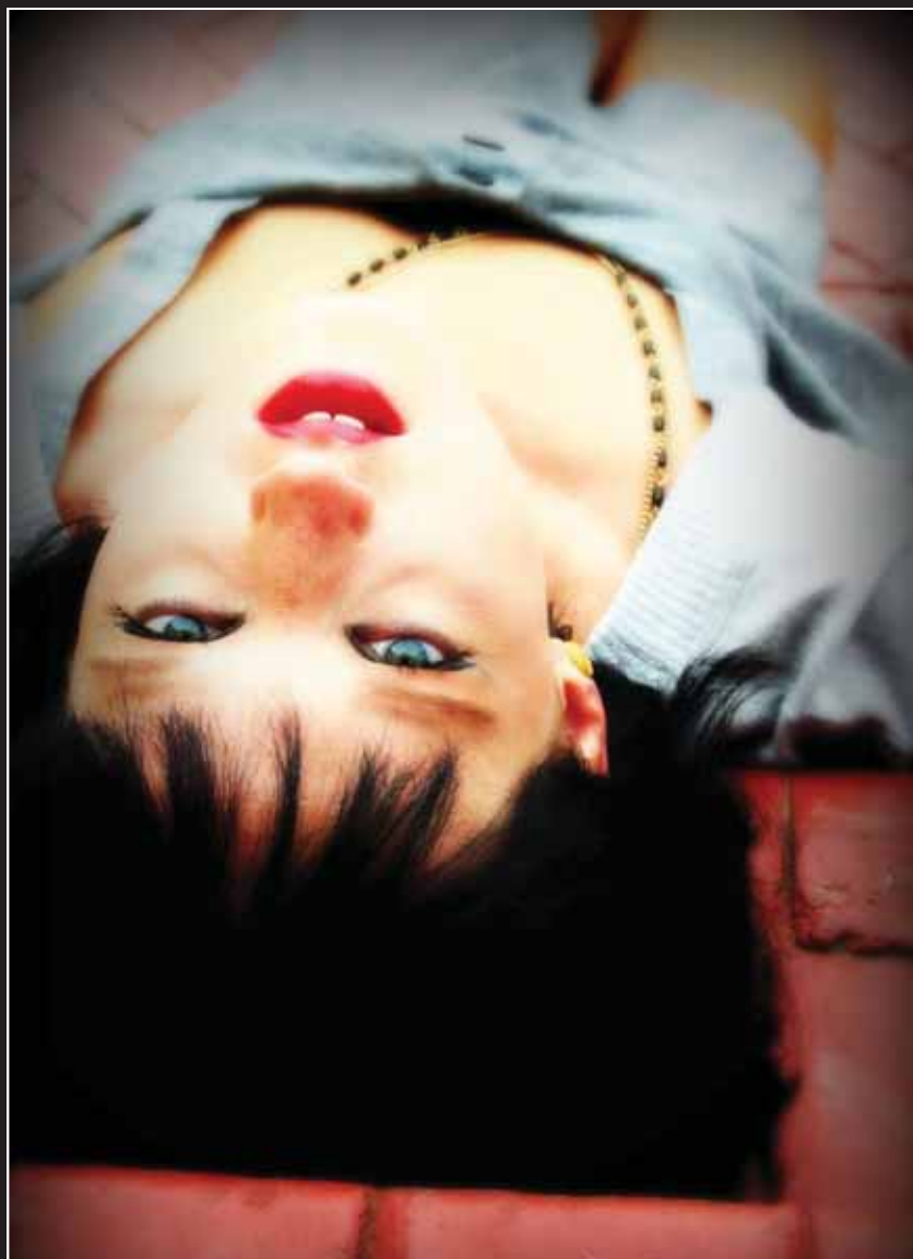
No. 16 Title: Staring Through The Silence Shot in Clovis, CA, USA