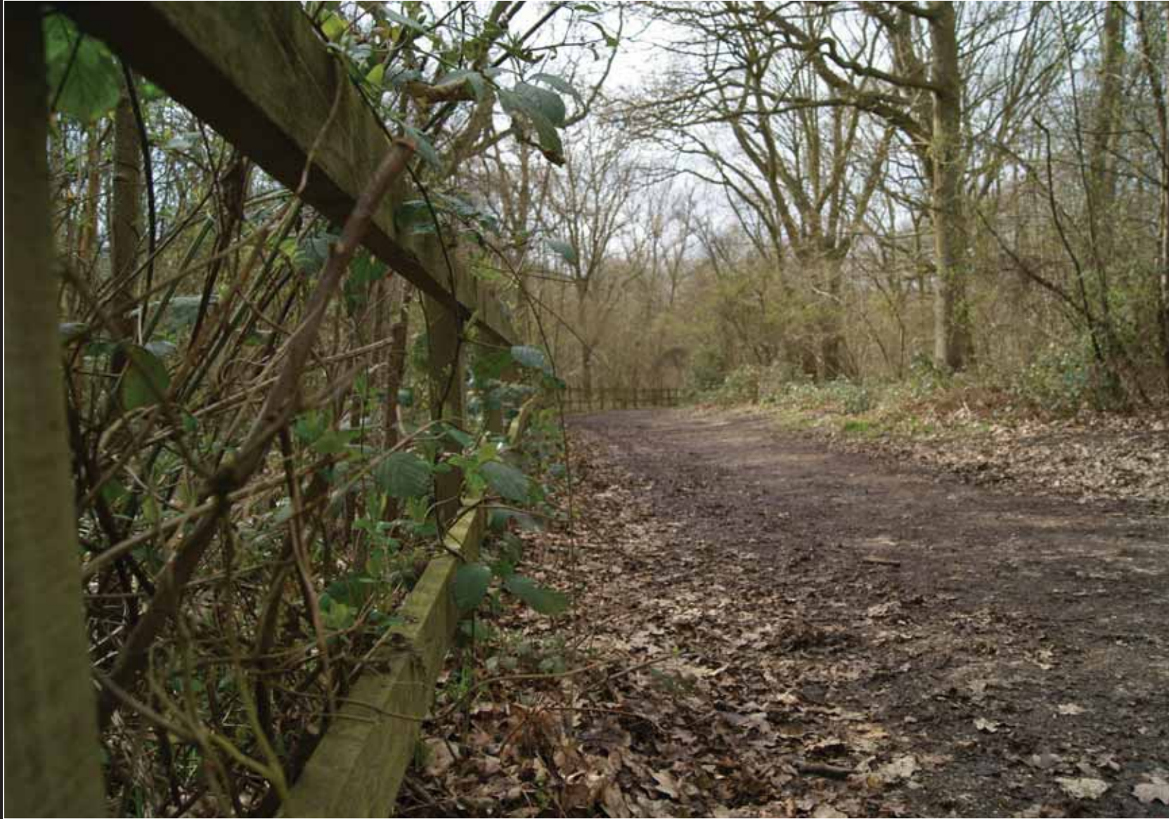
No. 8 Photographer: Alexandru Loja , UK Title: Unknown future Shot in Colchester, UK