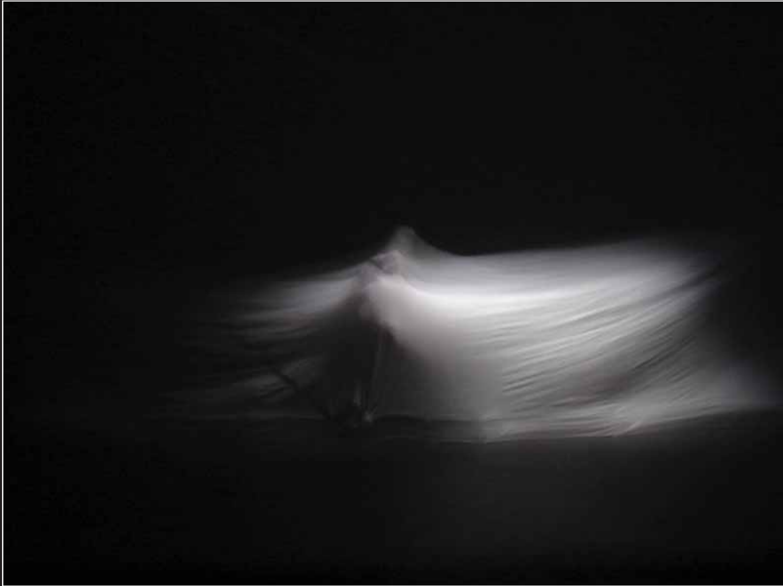
No. 13 Photographer: Aliko Arnaouti , Switzerland Title: tr-UP Shot in London, UK