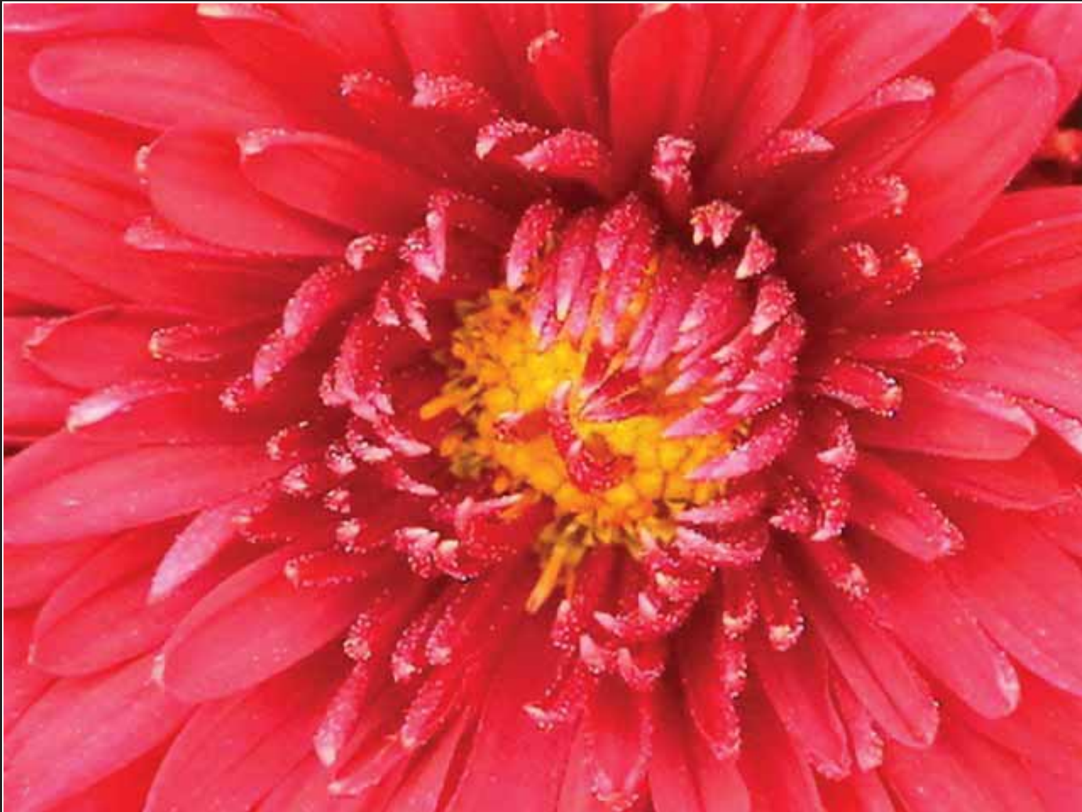
No. 1 Photographer: Aakash Gupta, India Title: Bee-ing Fed Shot in a garden in India