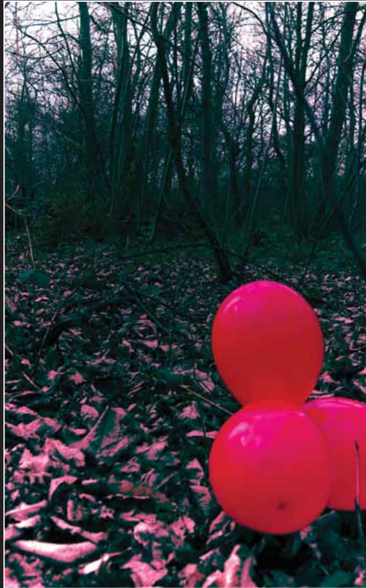
No. 9 Title: Baloons in Forest Shot in Colchester, UK