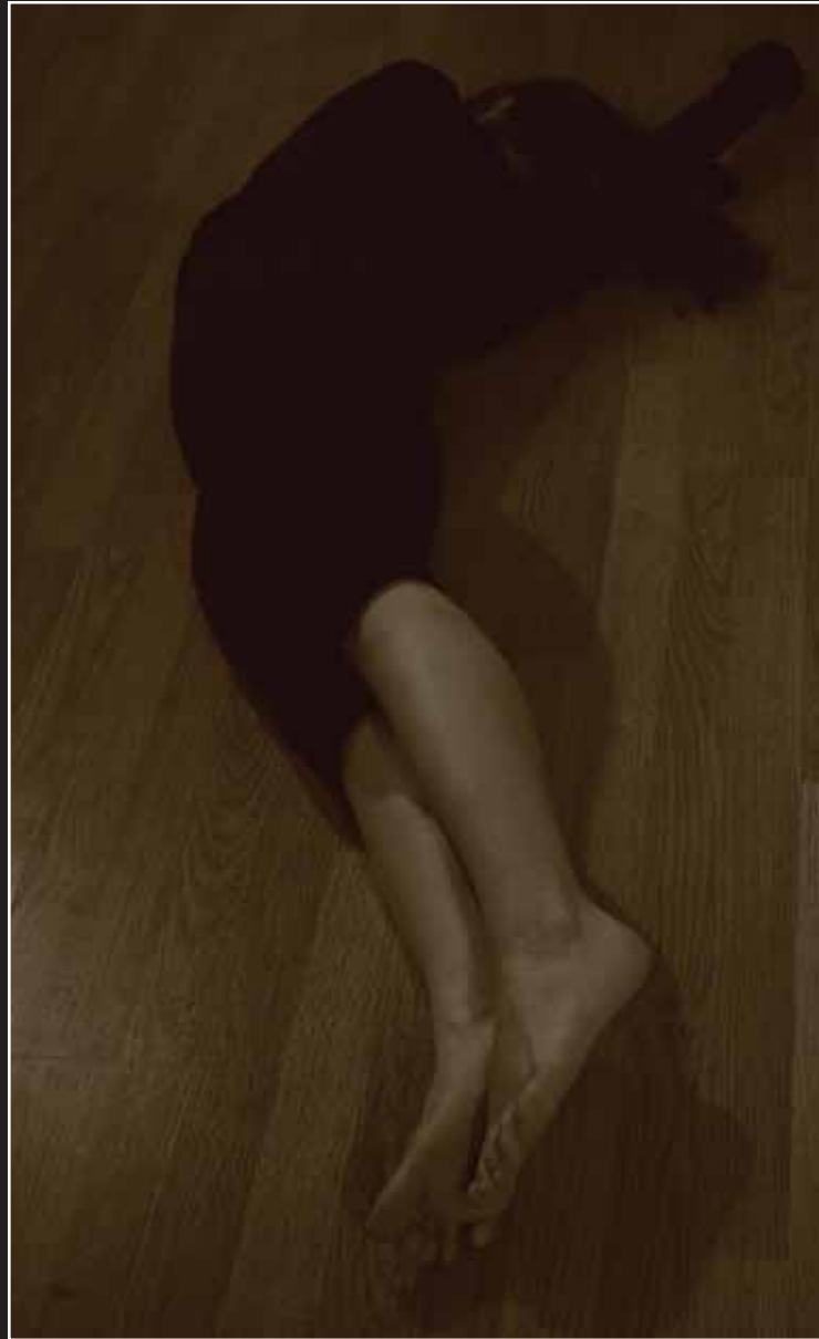
No. 15 Title: FREEZing Shot in Athens, Greece