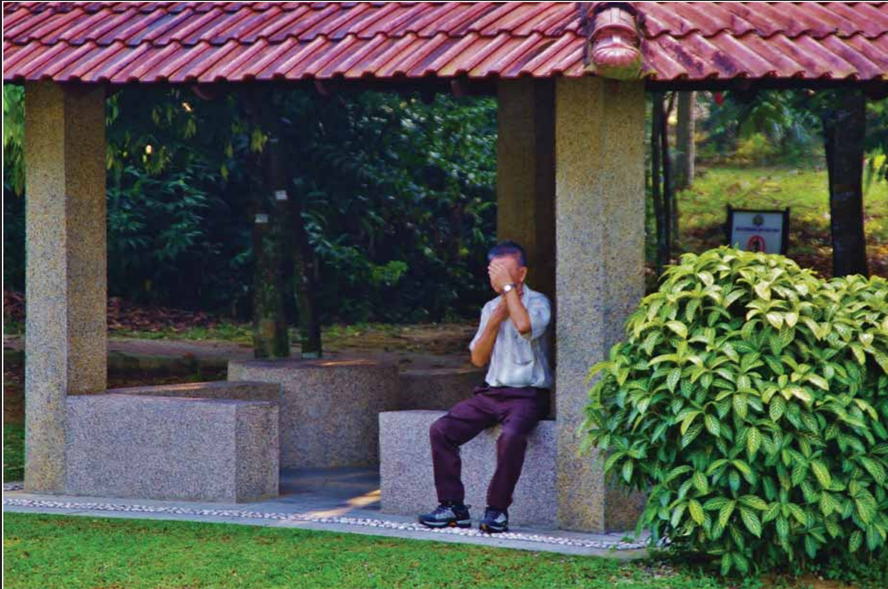
No. 10 Title: Feeling sick He is feeling quite sick and he is regulating his