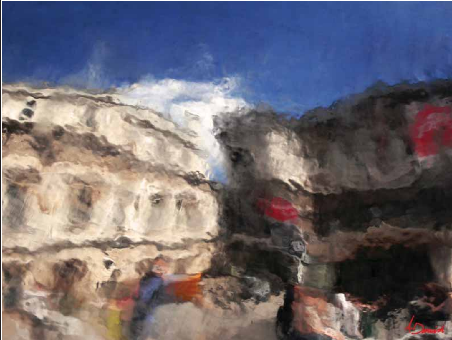
No. 4 Title: Urban Abstract Shot in London