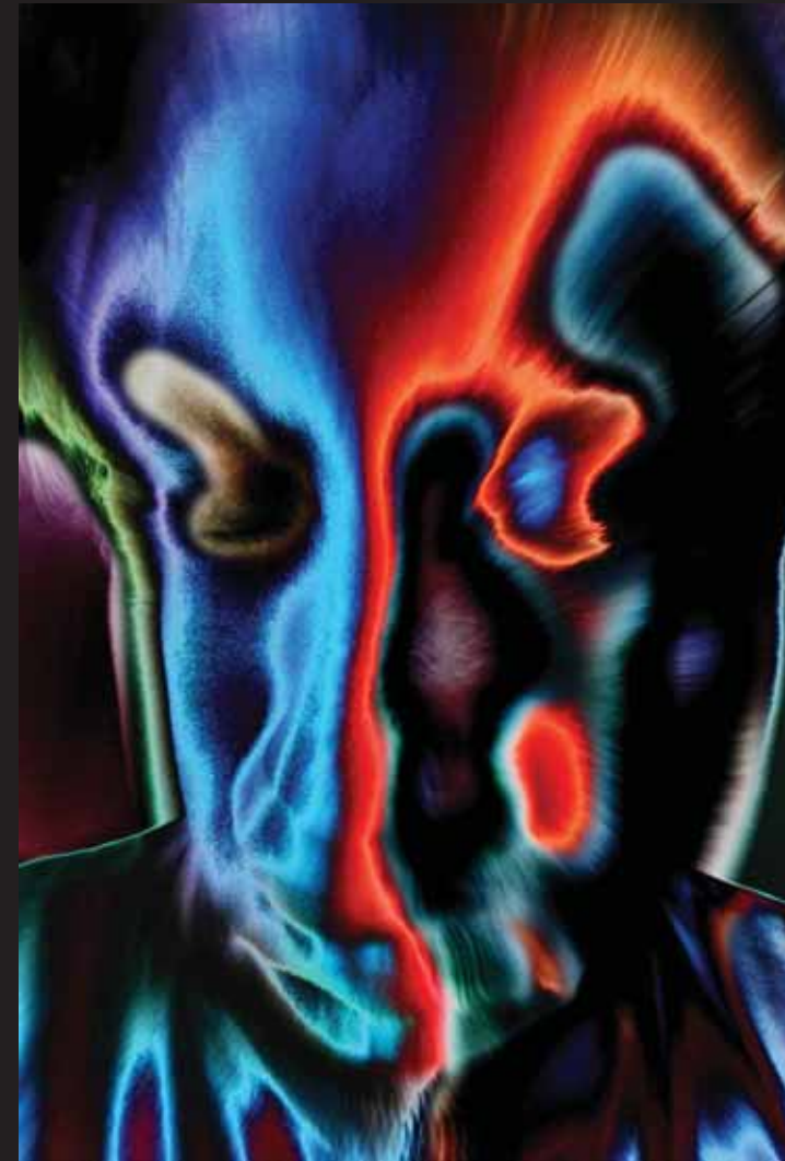
No. 18 Title: The person with epilepsy Shot in Göteborg, Sweden