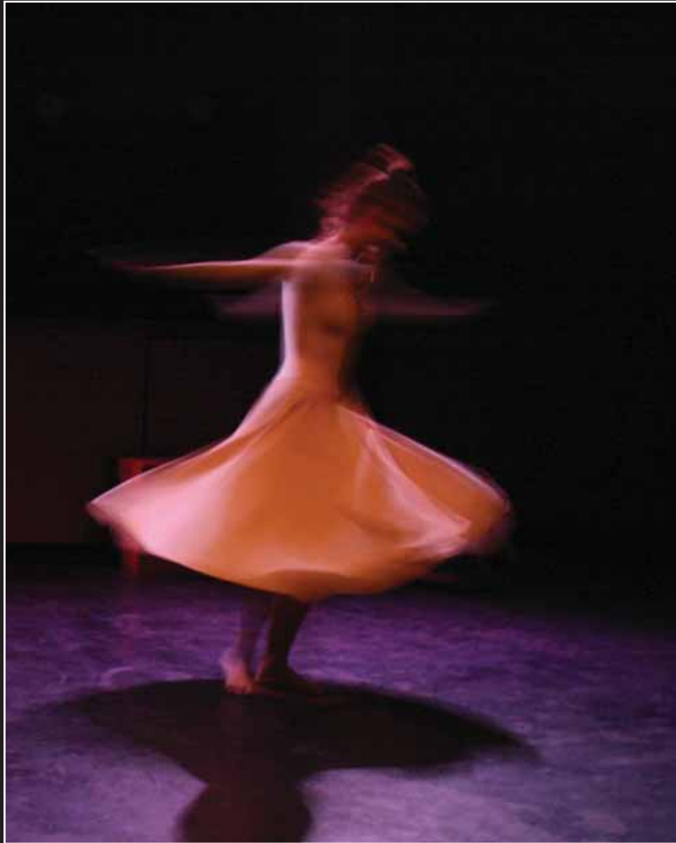
No. 12 Title: ROunDs Shot in Athens, Greece