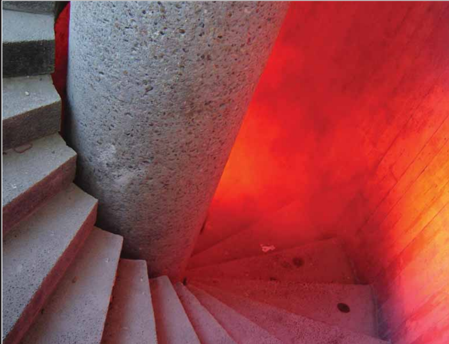
No. 14 Title: come On Shot in London, UK