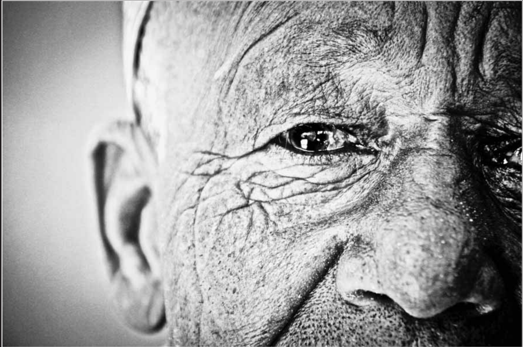
No. 5 Title: Wisdom Shot in Ethiopia