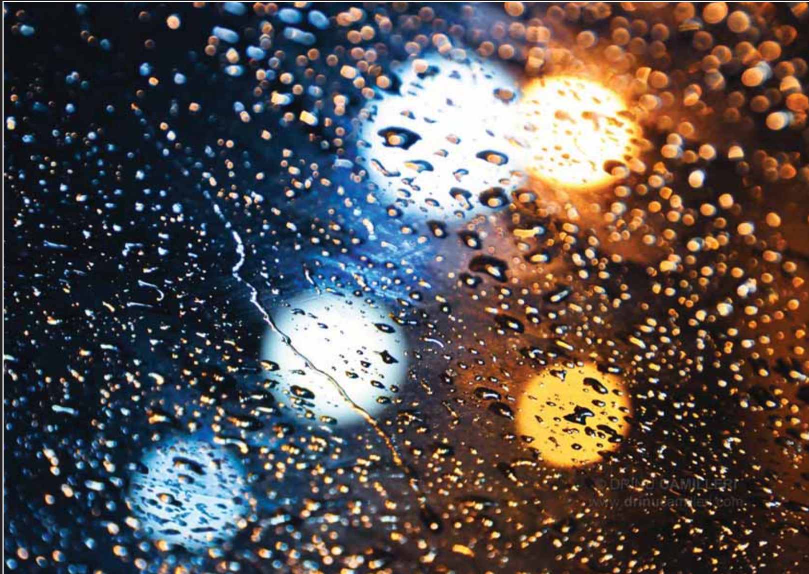
No. 3 Title: Dasein Shot in Malta