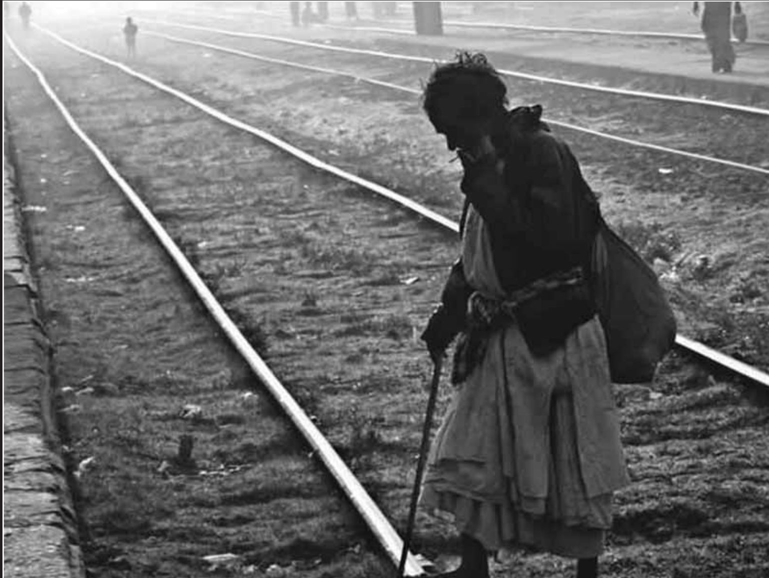
No. 17 Title: Silent Walker Shot in Kamlapur railway Dhaka in Bangladesh