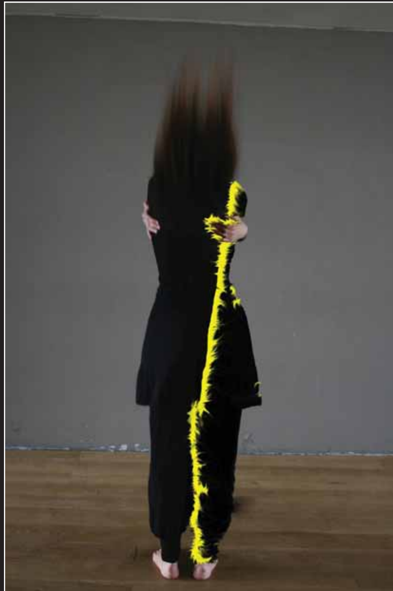
No. 11 Title: Yellow flame Shot in Athens, Greece