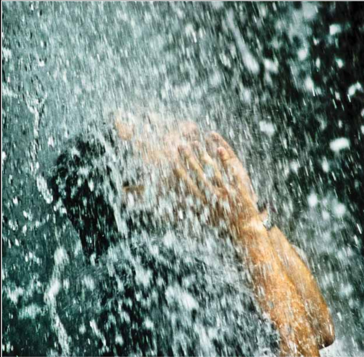
No. 7 Title: Raw Shot in Santa Catalina, Peru