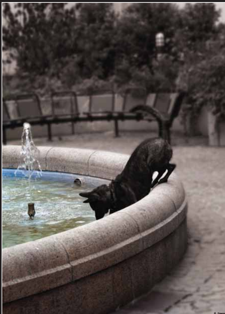
No. 2 Photographer: Abigail Simons, Luxembourg Title: Water dog A dog that jumped into the fountain