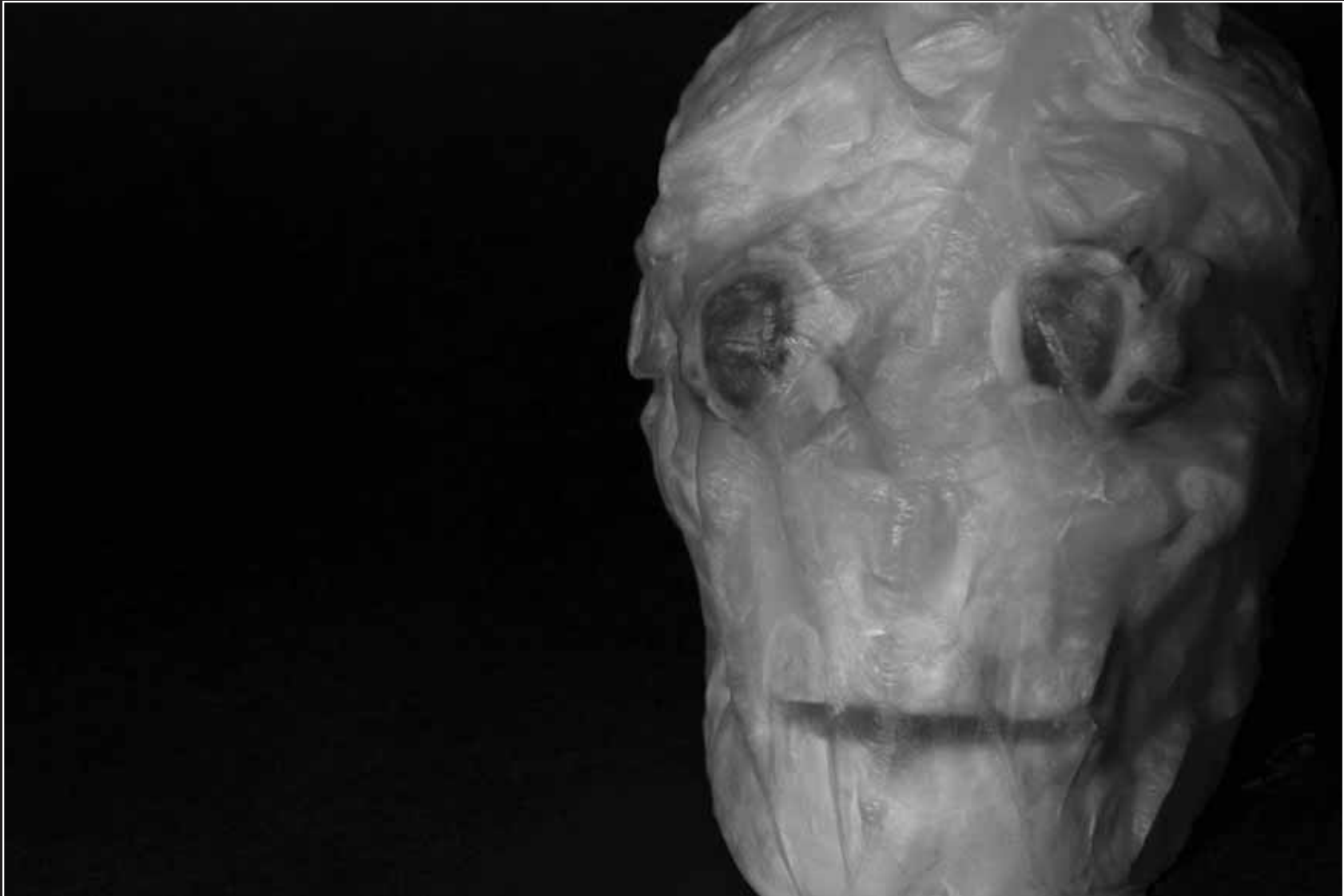
No. 174 Title: Social ID Shot in Bucharest, Romania