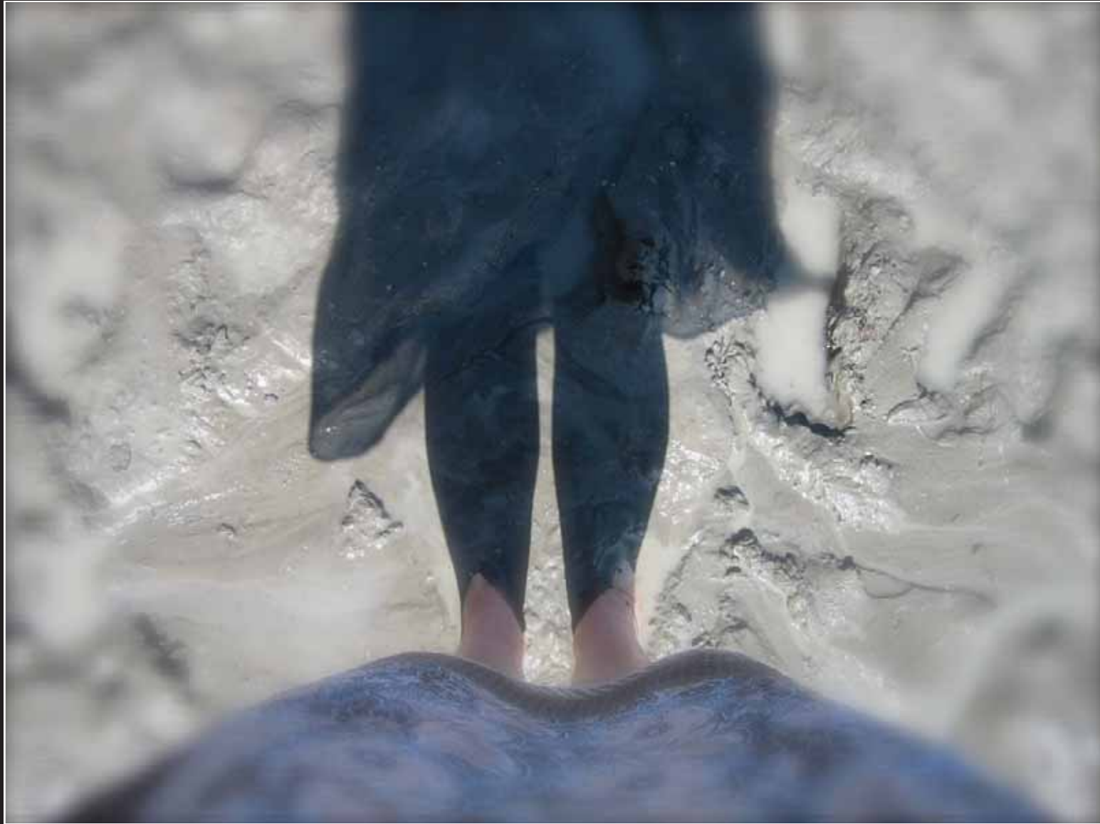
No. 166 Title: Epilepsy is like a shadow Sometimes it comes and will not go away. Other times you can't see it.