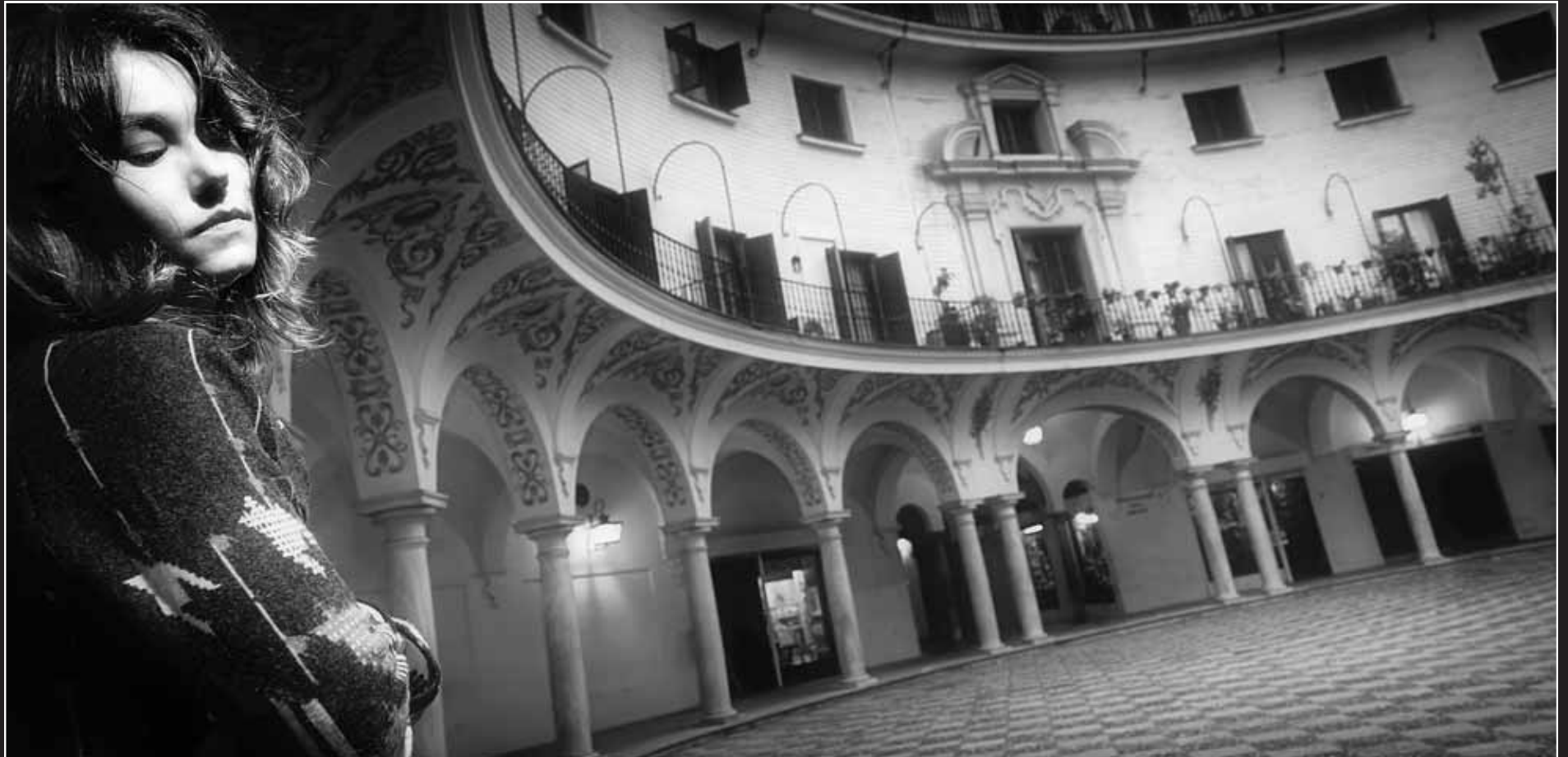
No. 177 Title: Nobody but me Shot in Seville, Spain