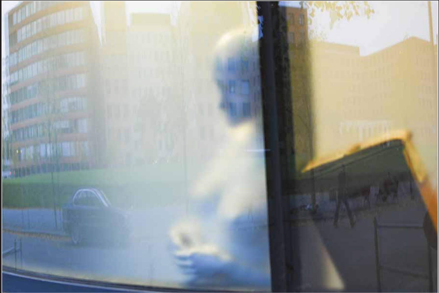
No. 172 Title: Nostalgia Shot in Berlin, Germany