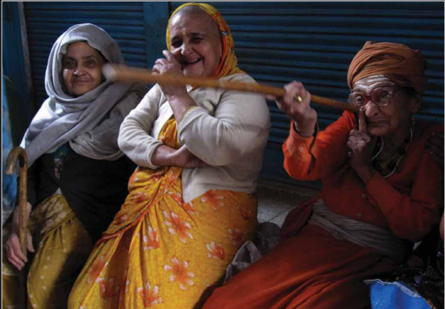
No. 175 Title: Through the eyes of epilepsy The elderly woman (83 years) cracks joke with her friends.