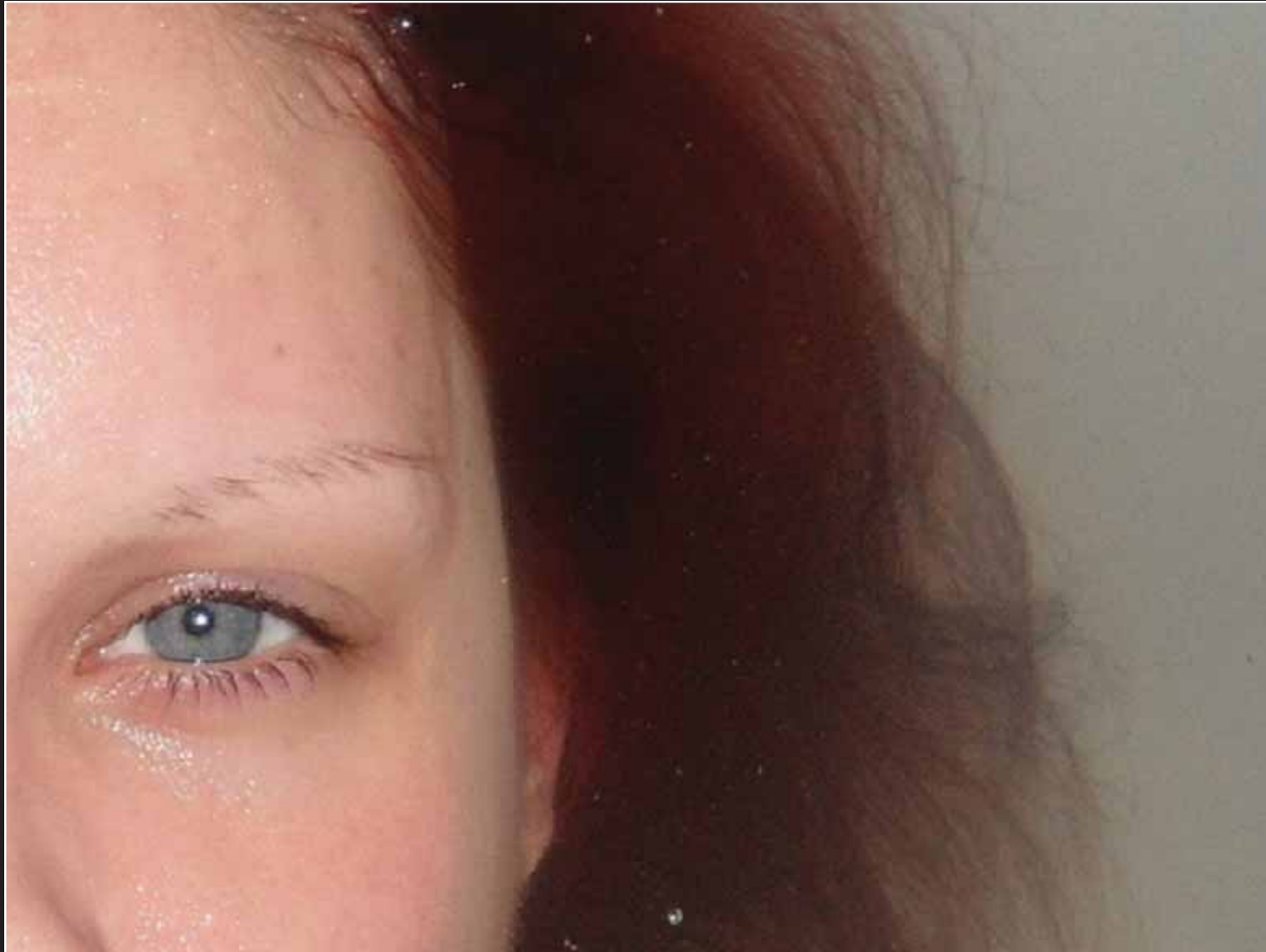
No. 176 Title: The feeling of epilepsy I don't hear anything like under the surface