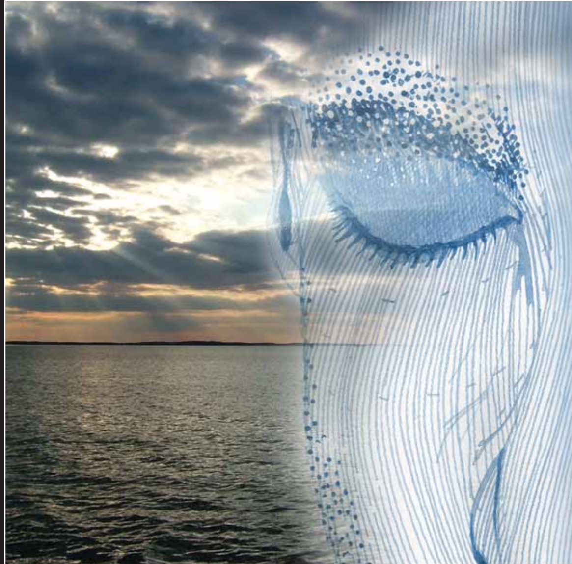
No. 162 Title: Sleeping The feeling after a seizure...