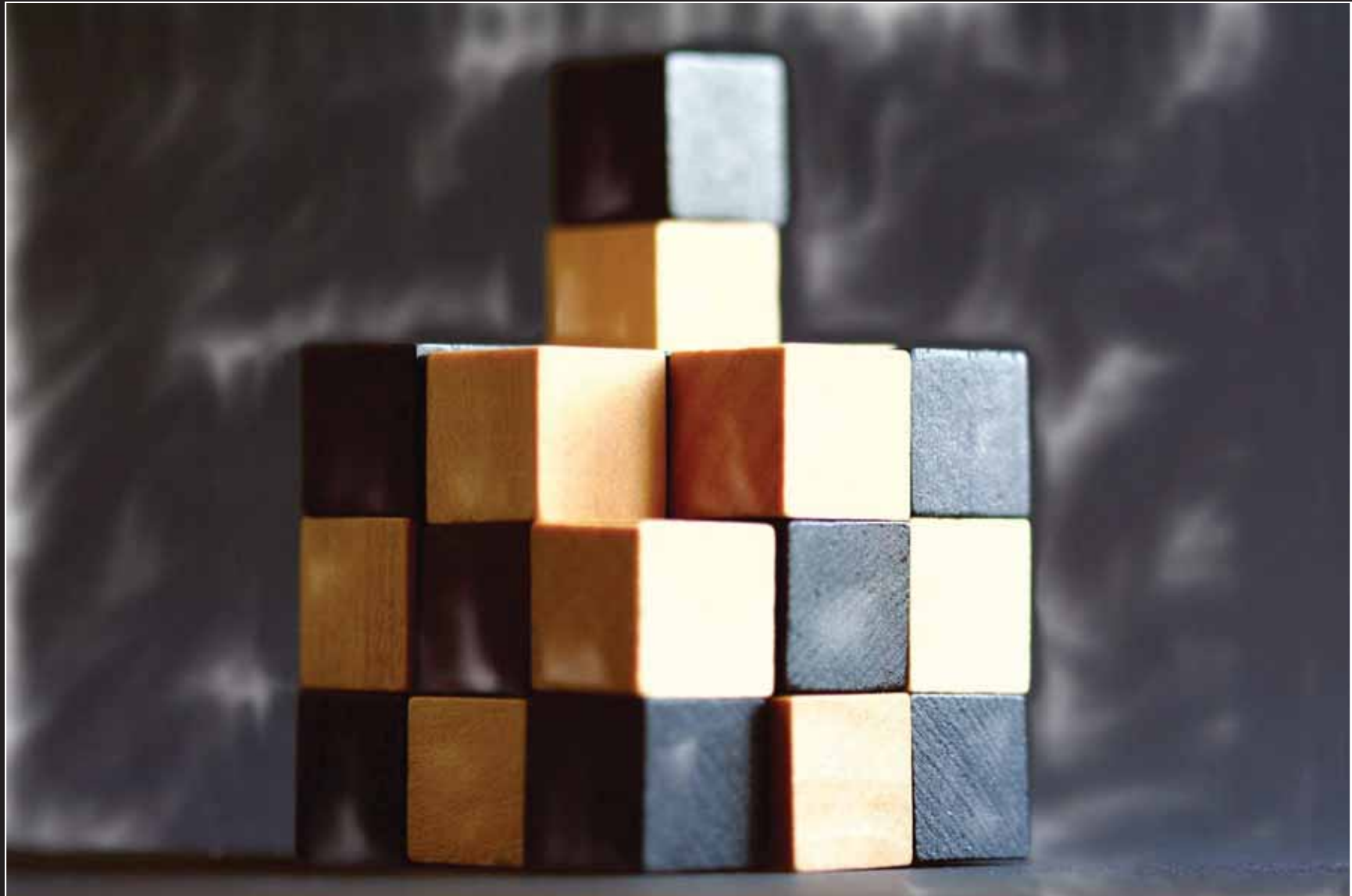
No. 168 Title: The impossible/illogical/incomplete cube Shot in Borlänge, Sweden