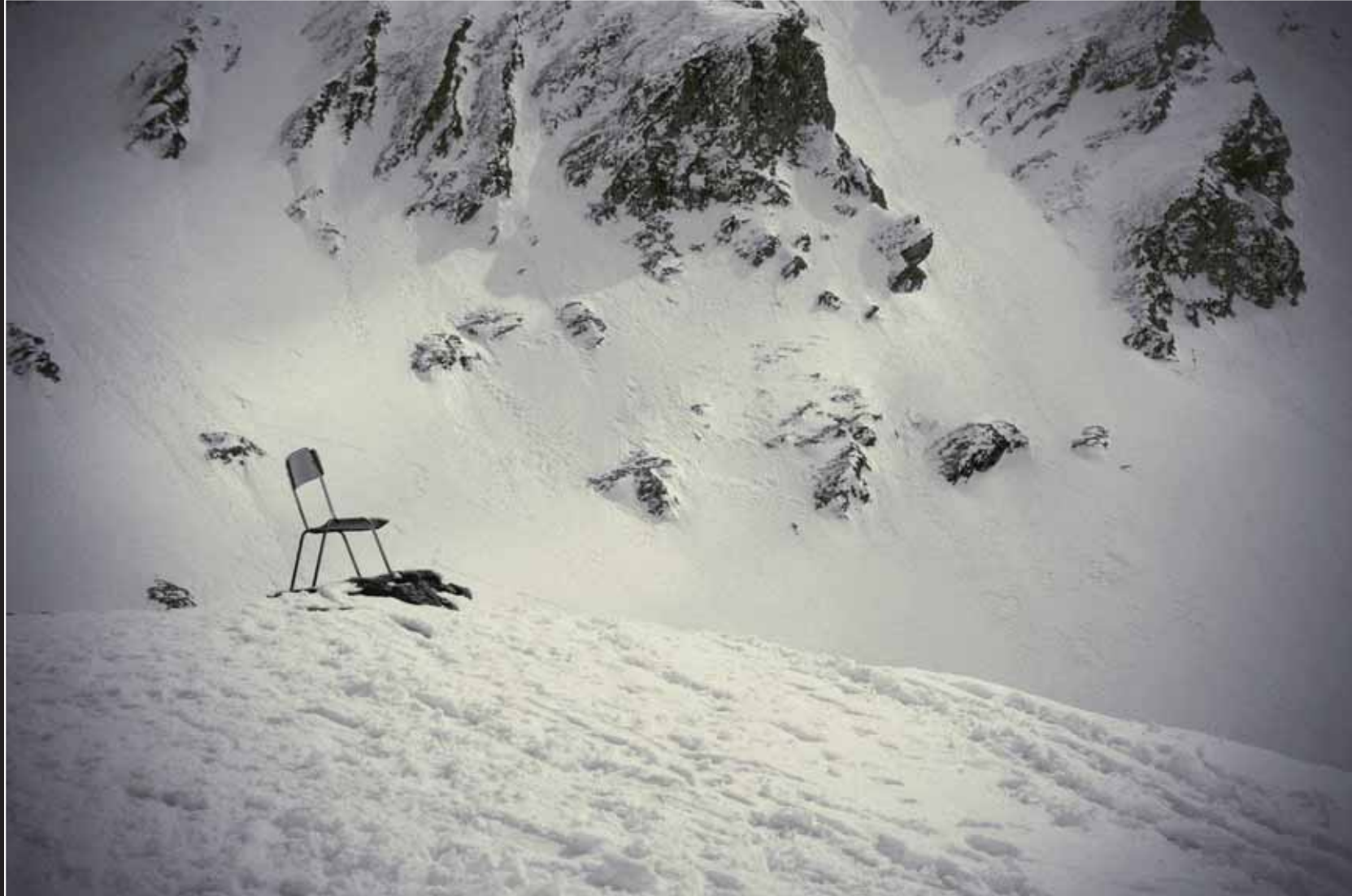
No. 171 Title: My Lonely Planet Shot in Balea, Romania