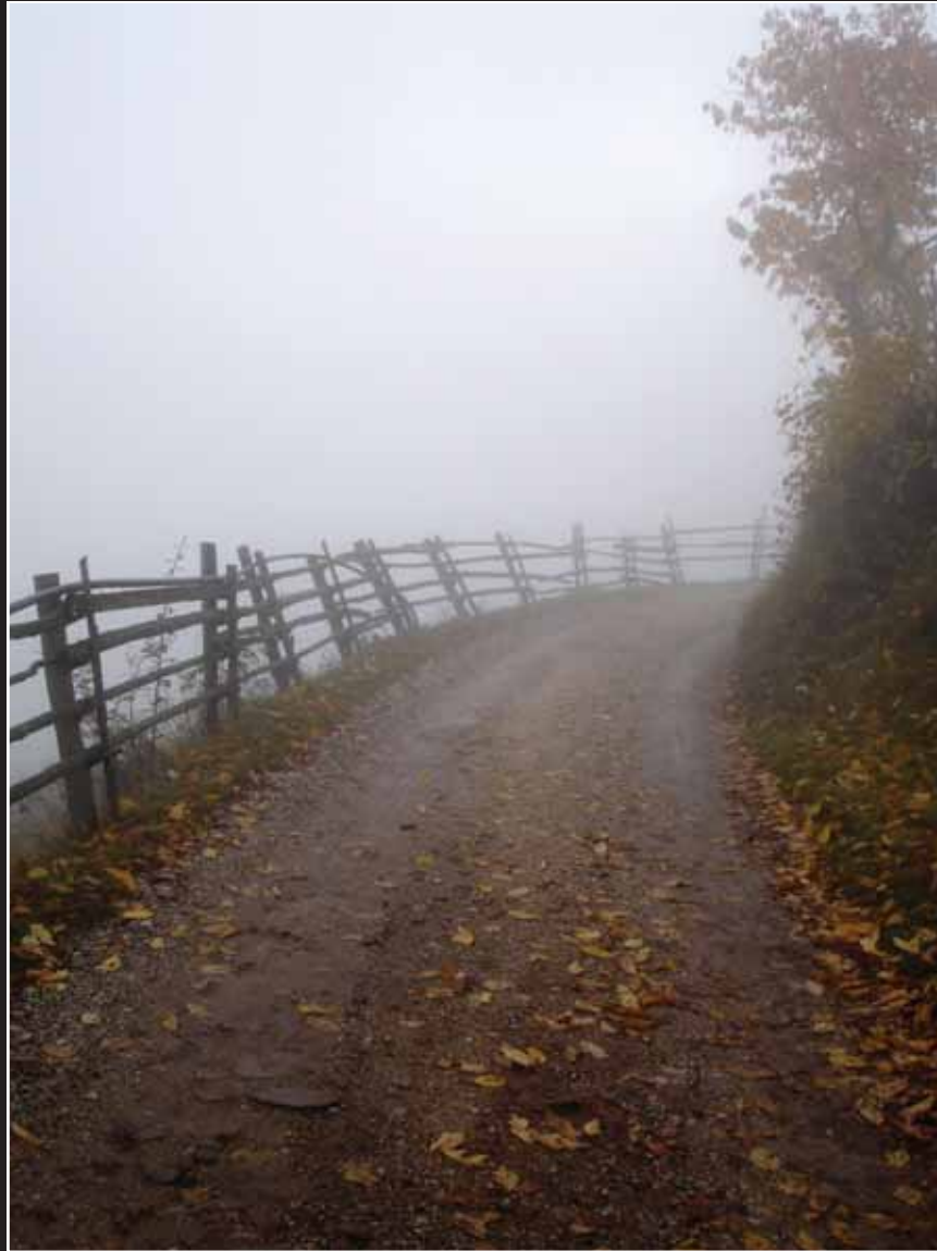
No. 164 Title: Waft of mist This picture represents the beginning of my epilepsy.