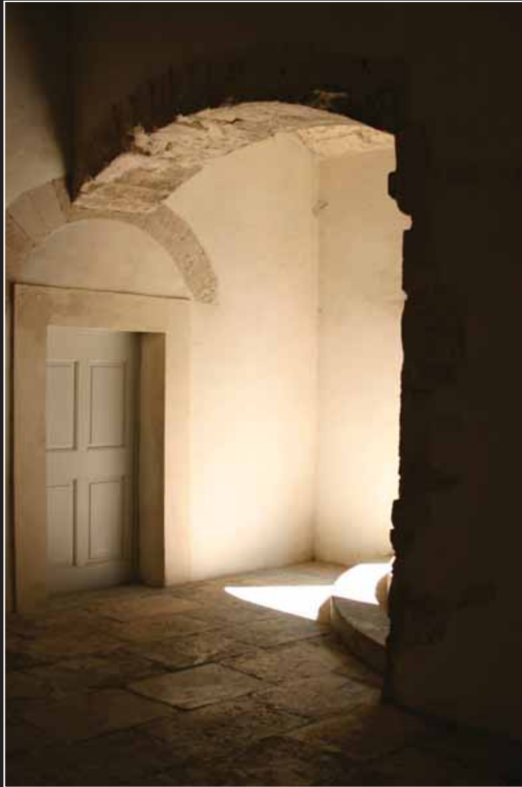
No. 163 Title: Rescue Door You feel the seizure coming, you can see the rescue-door...but you can't reach it!