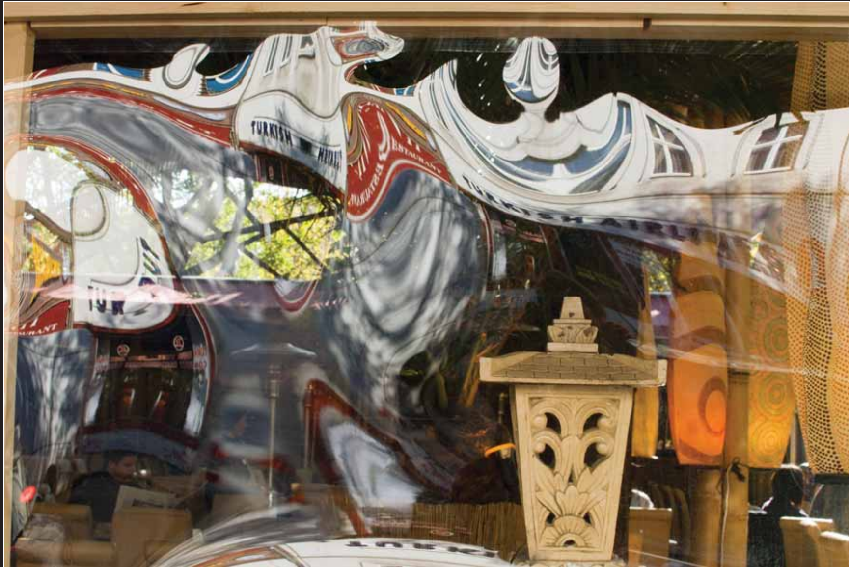
No. 173 Title: Confusion Shot in Berlin, Germany