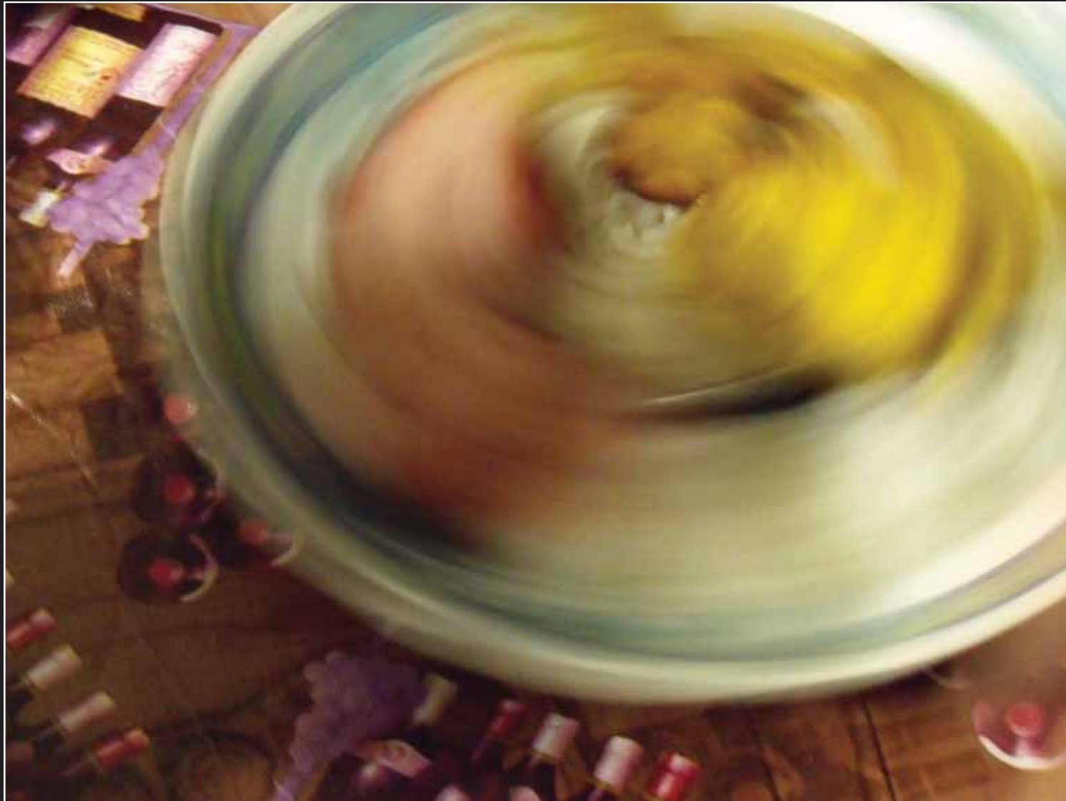
No. 170 Title: "Losing Focus" Shot in Holguin, Cuba