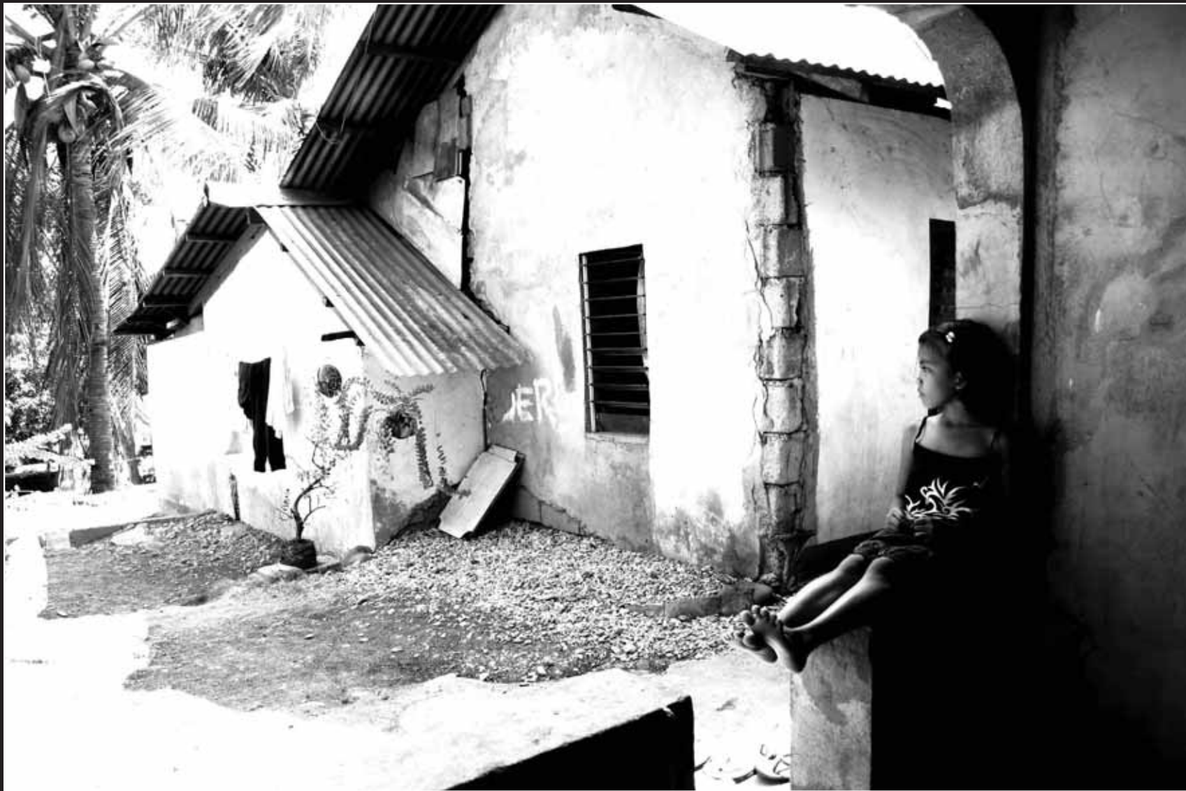
No. 185 Title: Solitude Shot in Isla Verde, Batangas, Philippines