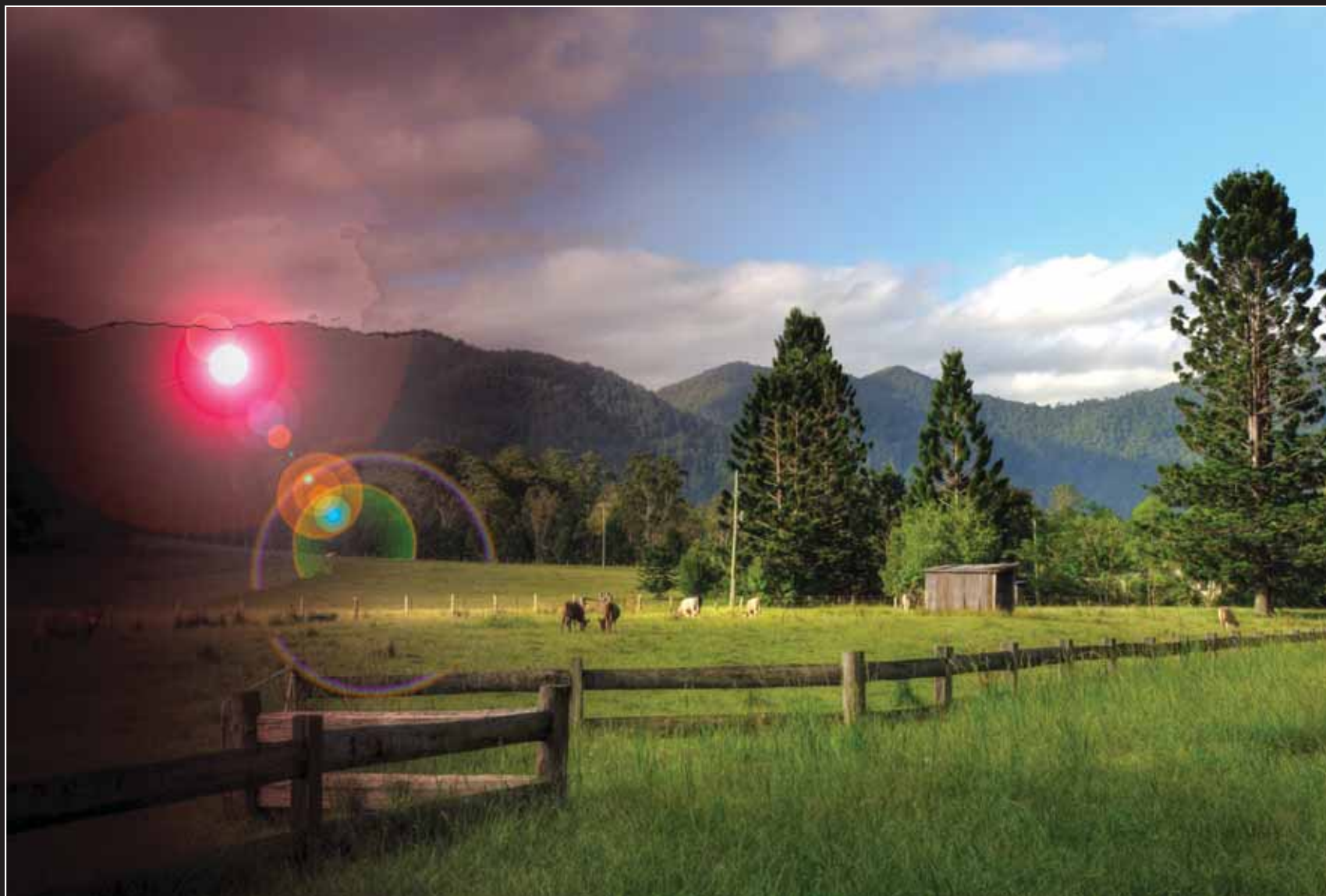
No. 200 Title: Storm Approaching The storm within...