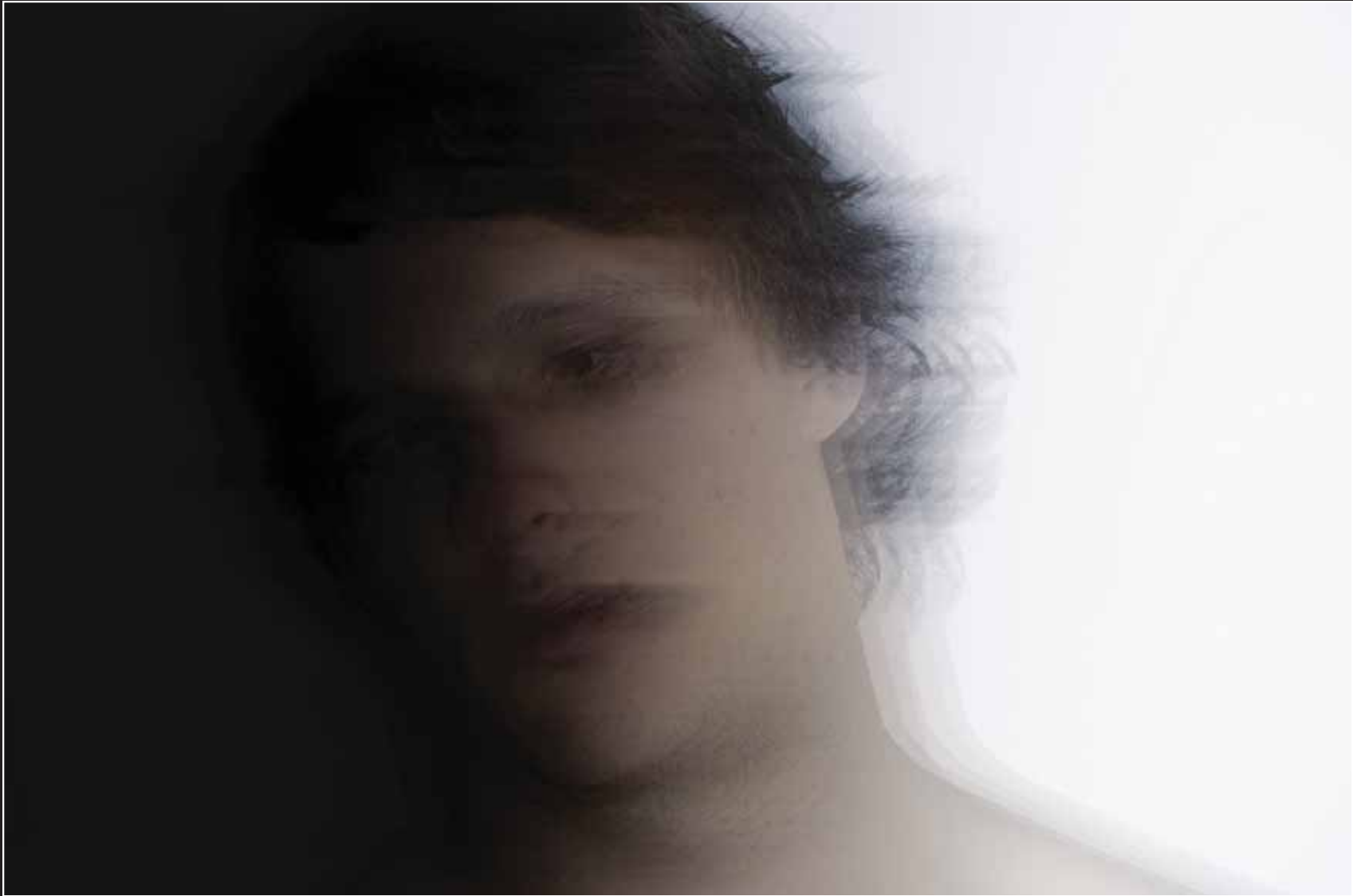
No. 199 Title: Losing Focus Between the light and the darkness.