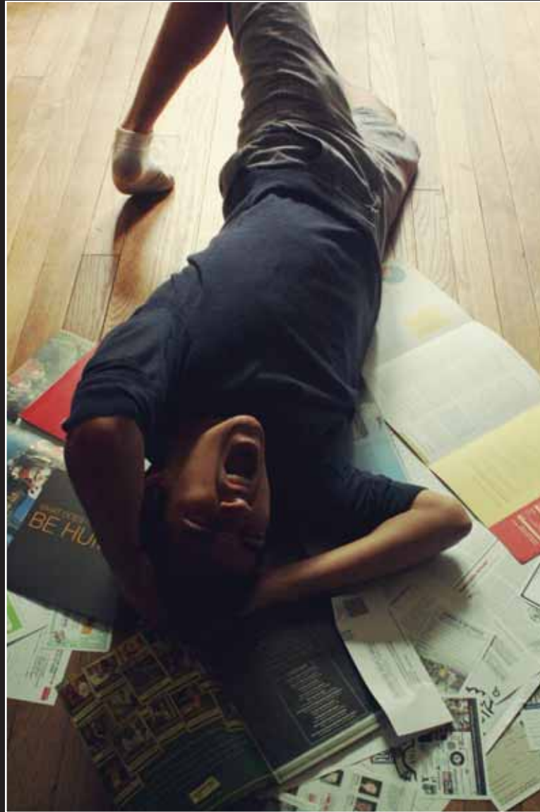
No. 182 Title: Please Let Me Go Having epilepsy feels like I'm trapped in my own body.