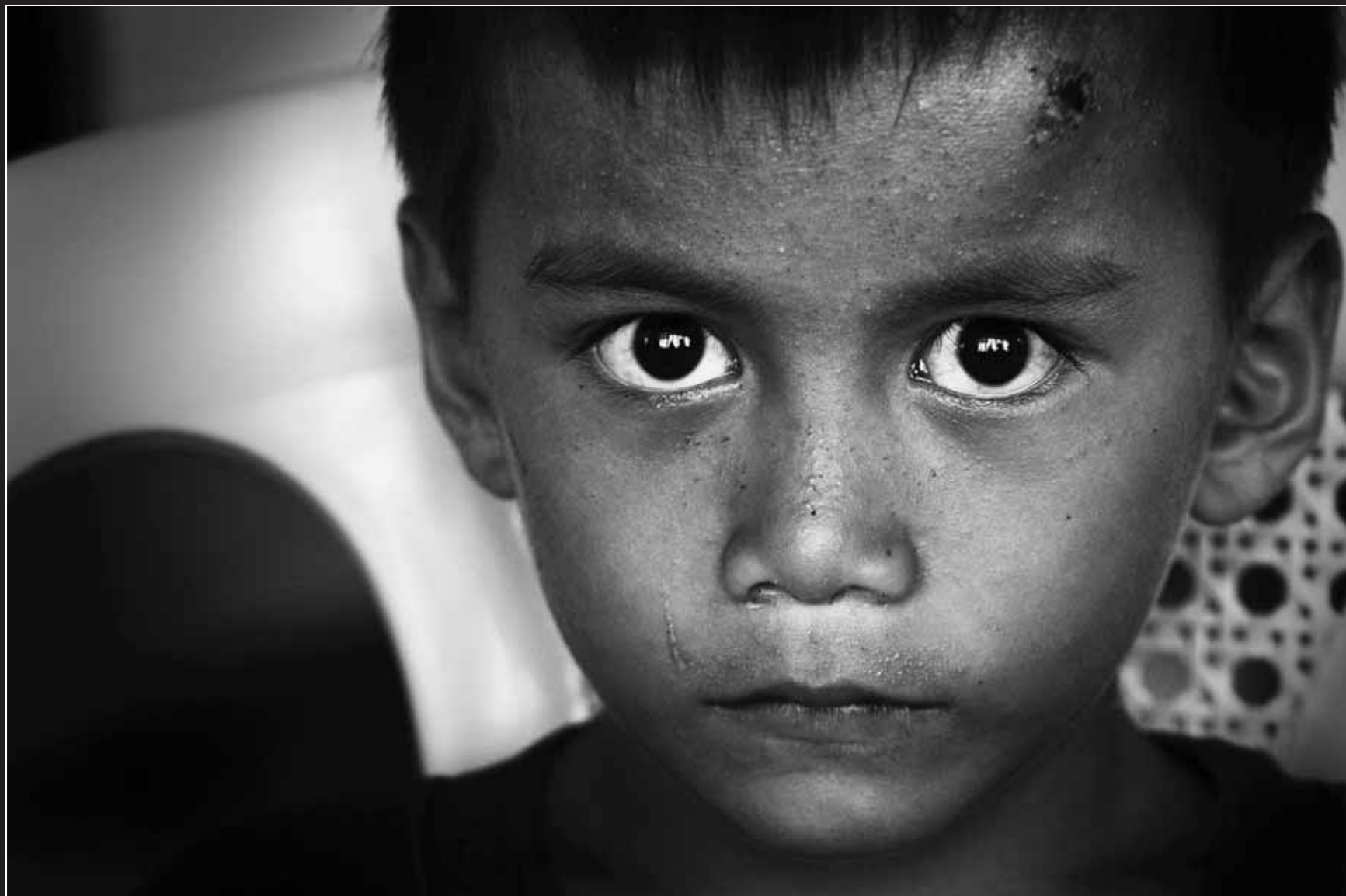
No. 187 Title: Look At Me Shot in Isla Verde, Batangas, Philippines