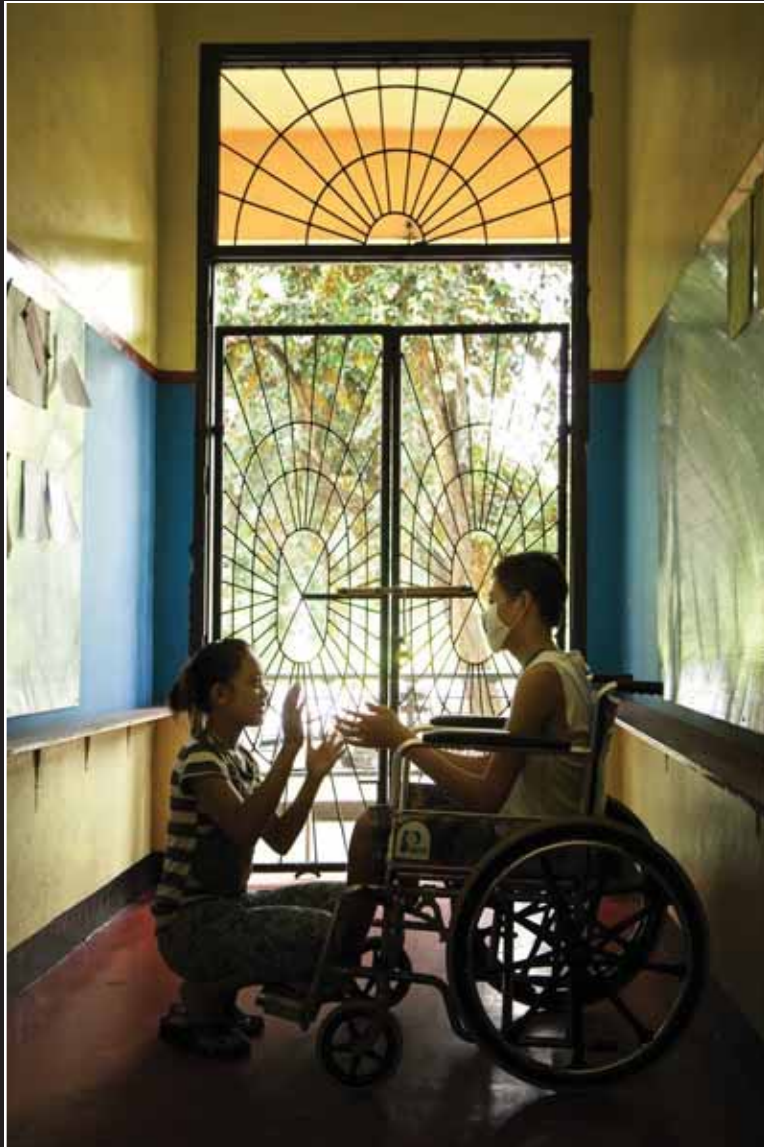
No. 183 Title: I am not alone The morale support from friends and family can uplift the spirit of every patient.