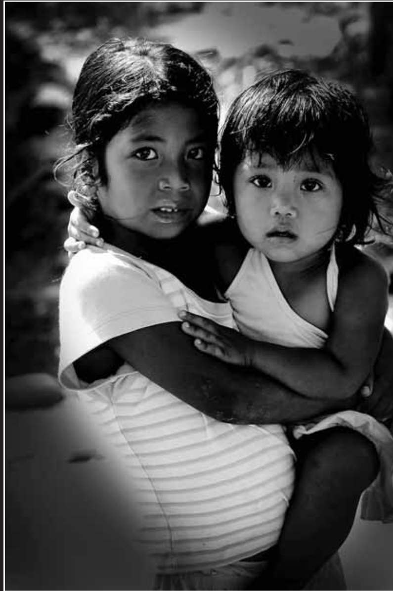
No. 184 Title: In My Sister's Arms Shot in Isla Verde, Batangas, Philippines