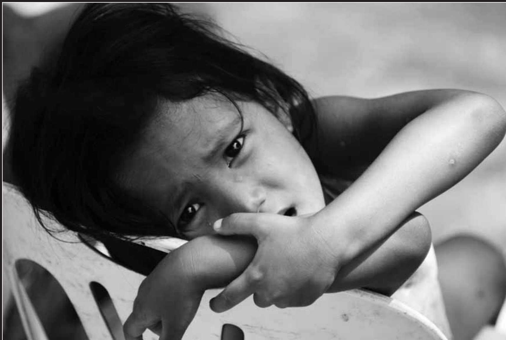
No. 188 Title: Looking up Shot in Isla Verde, Batangas, Philippines