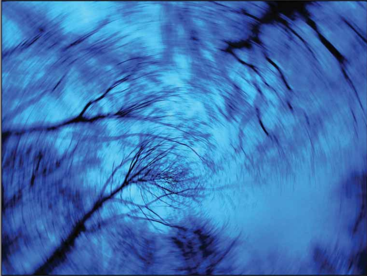
No. 195 Title: In another World Trees in Forest, Krsko, Slovenia