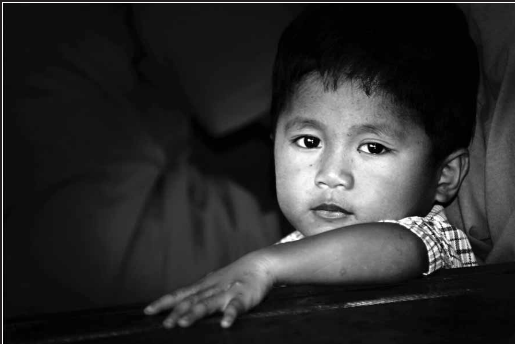
No. 186 Title: Hope Shot in Isla Verde, Batangas, Philippines