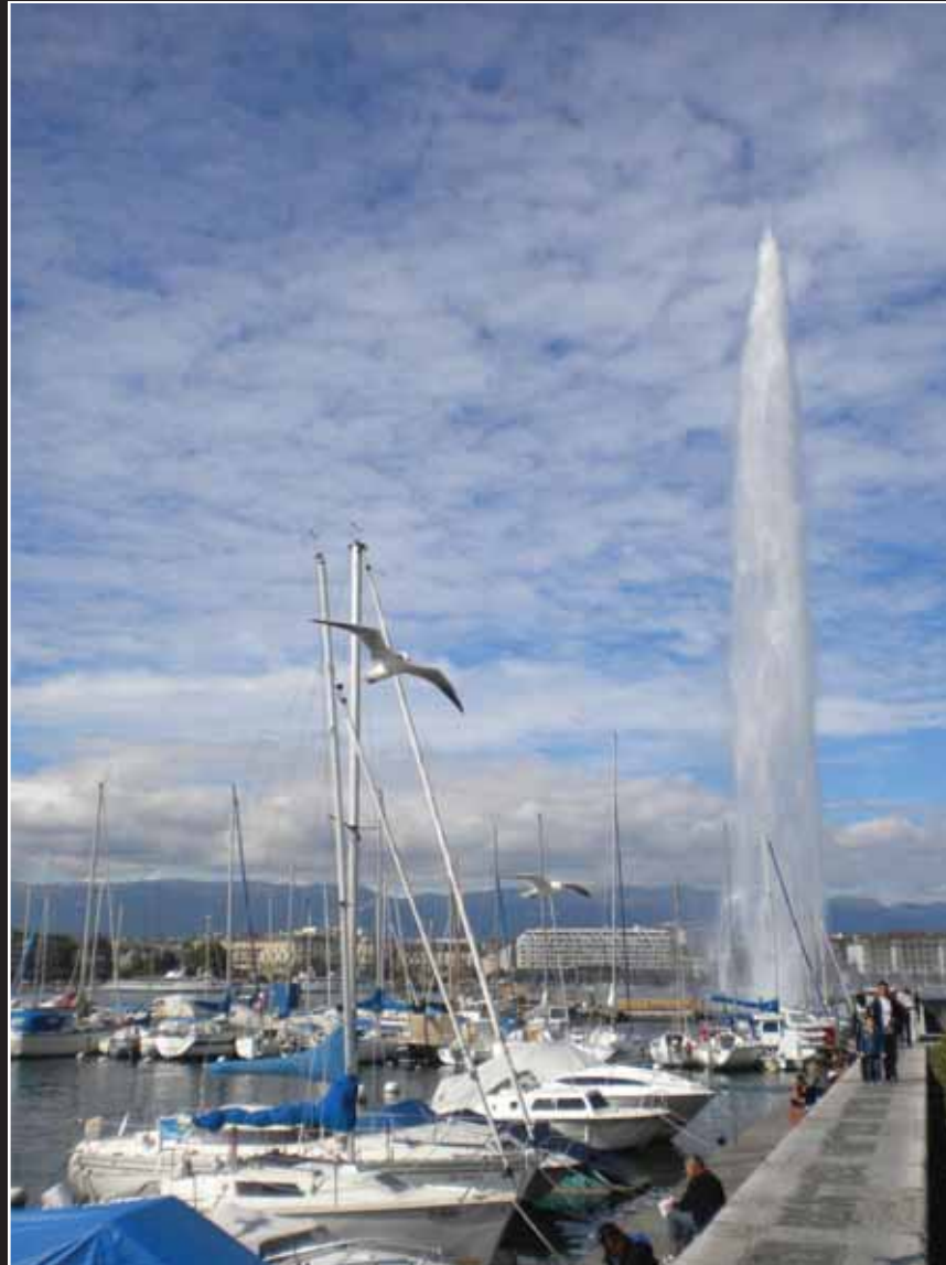
No. 197 Title: Seizure freedom Feeling of being seizure-free.