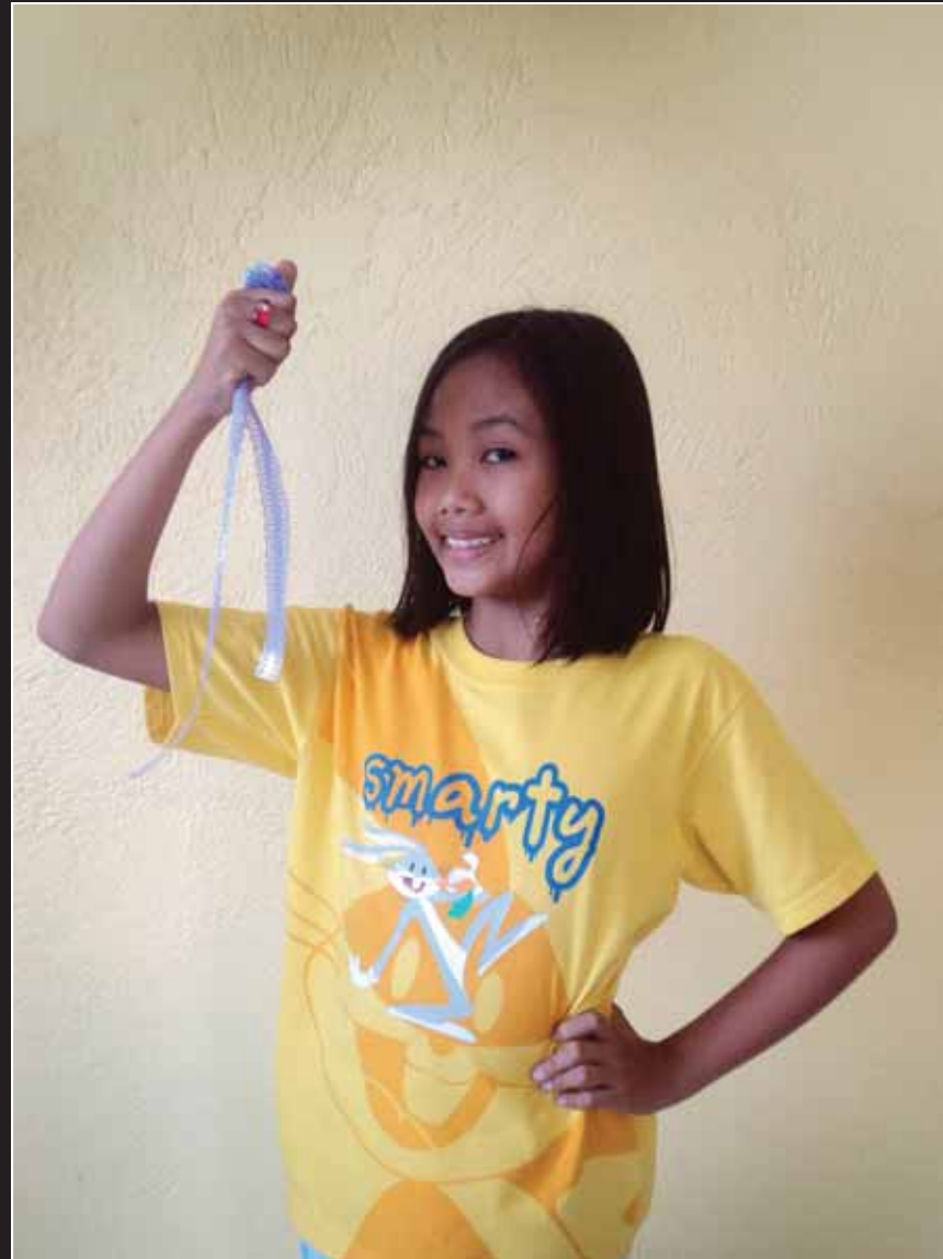
No. 189 Title: Purple Ribbon Shot in Calamba City, Laguna, Philippines