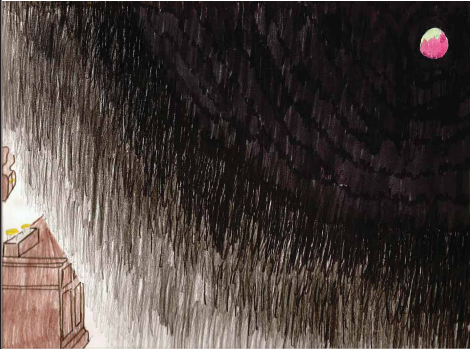
No. 198 Photographer: Pasquale Striano, Italy Title: Occipital Lobe seizure