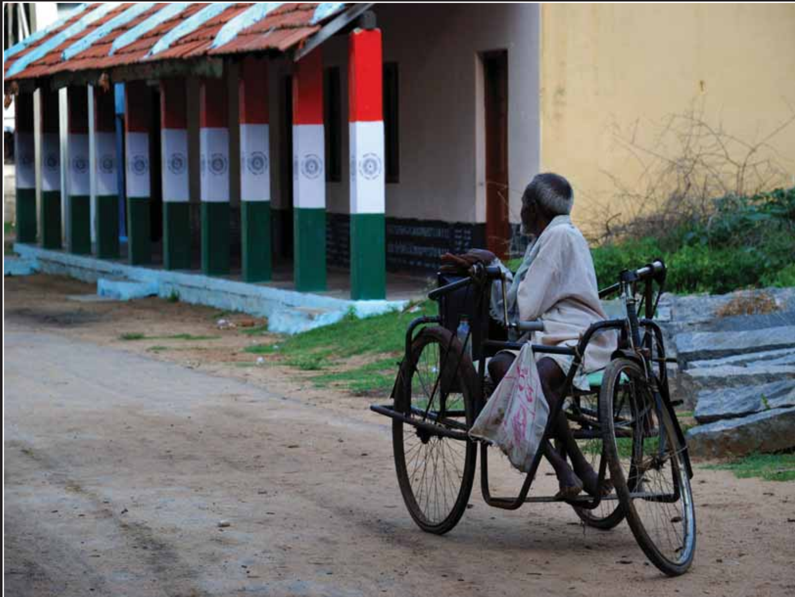
No. 40 Title: Struggle for Existence His struggle for existence inspired me to capture this photograph.