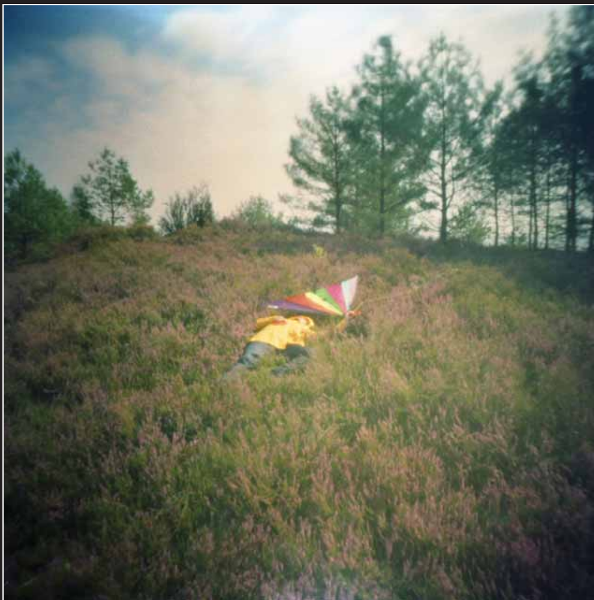
No. 30 Title: Fall Shot in Rudno, Poland