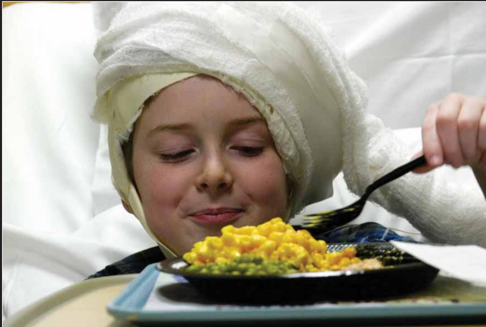
No. 37 Title: This isn't so bad! Shot in Children's National Medical Center, Washington, USA