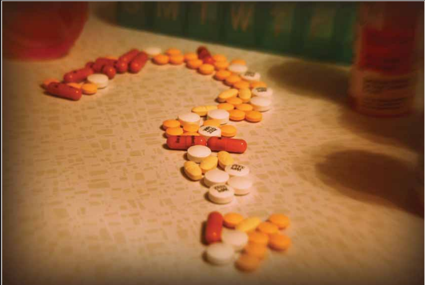
No. 35 Title: Will the Meds Help The uncertainty that people with epilepsy face when undergoing medication regimens as treatment.