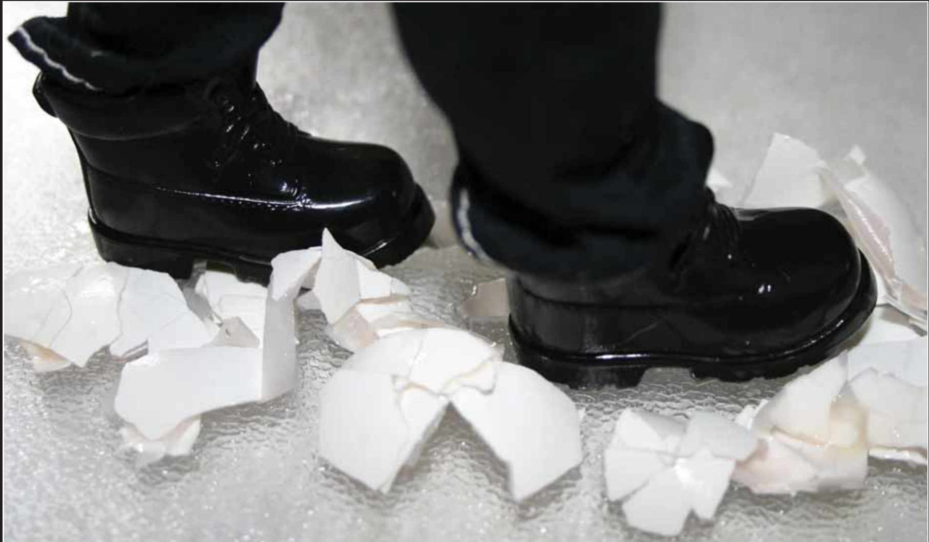
No. 33 Title: Walking on Eggshells I used a Ken doll and a cutting board with real egg shells.