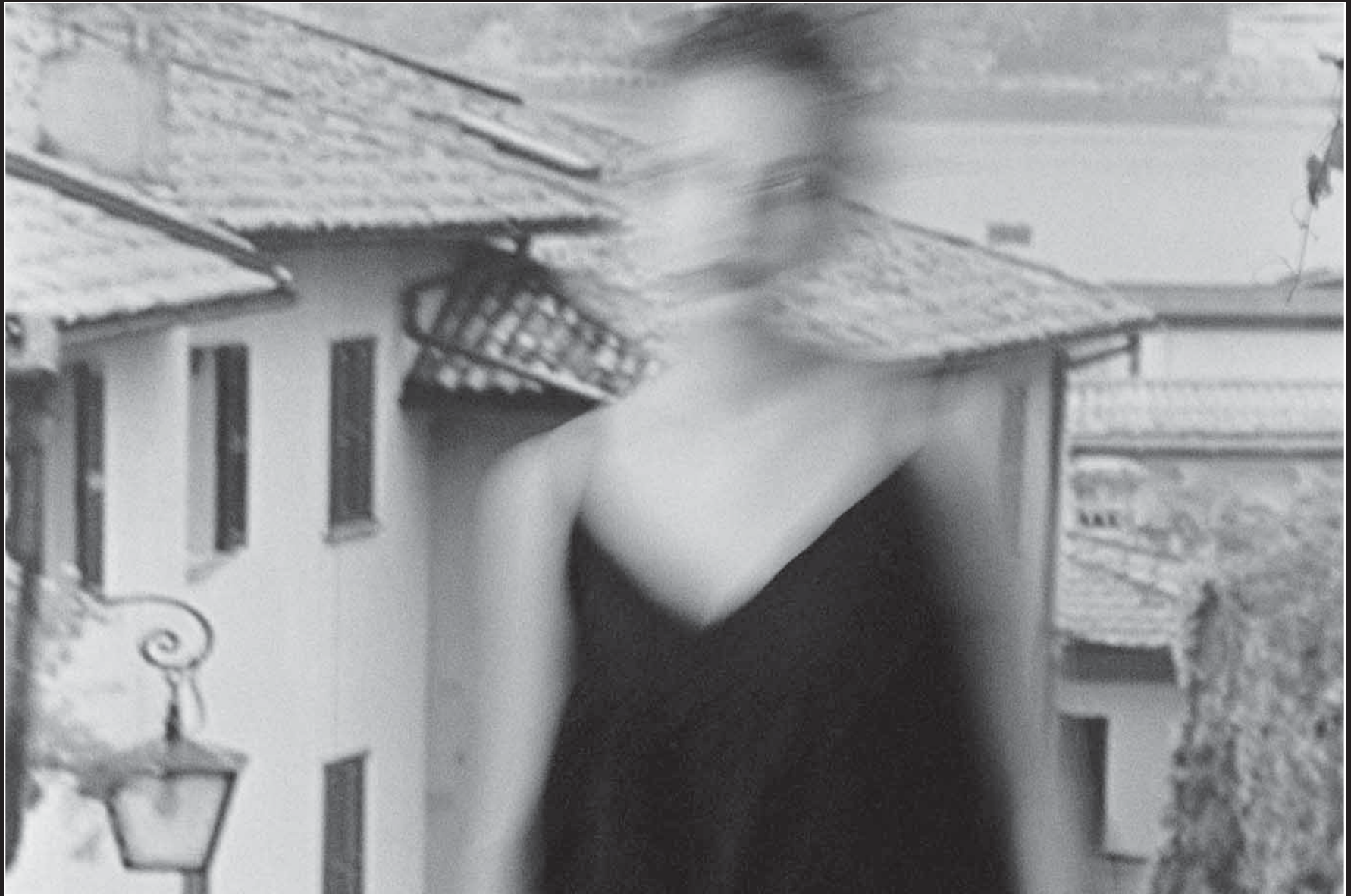
No. 32 Title: Then... Shot in Wroclaw, Poland