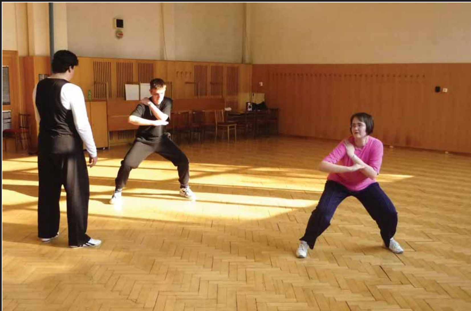
No. 38 Title: Anti-epileptic variation of Kung-fu Tai-Chi Seminary for members of "SME" - a group of young people with epilepsy