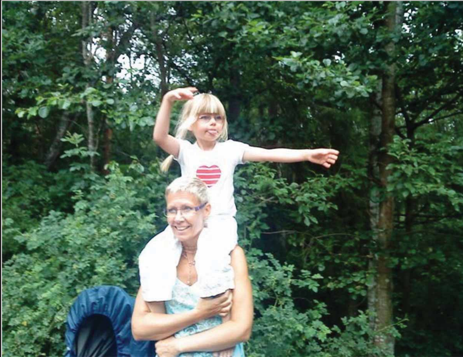
No. 36 Title: The energy of Epilepsy Myself and my daughter