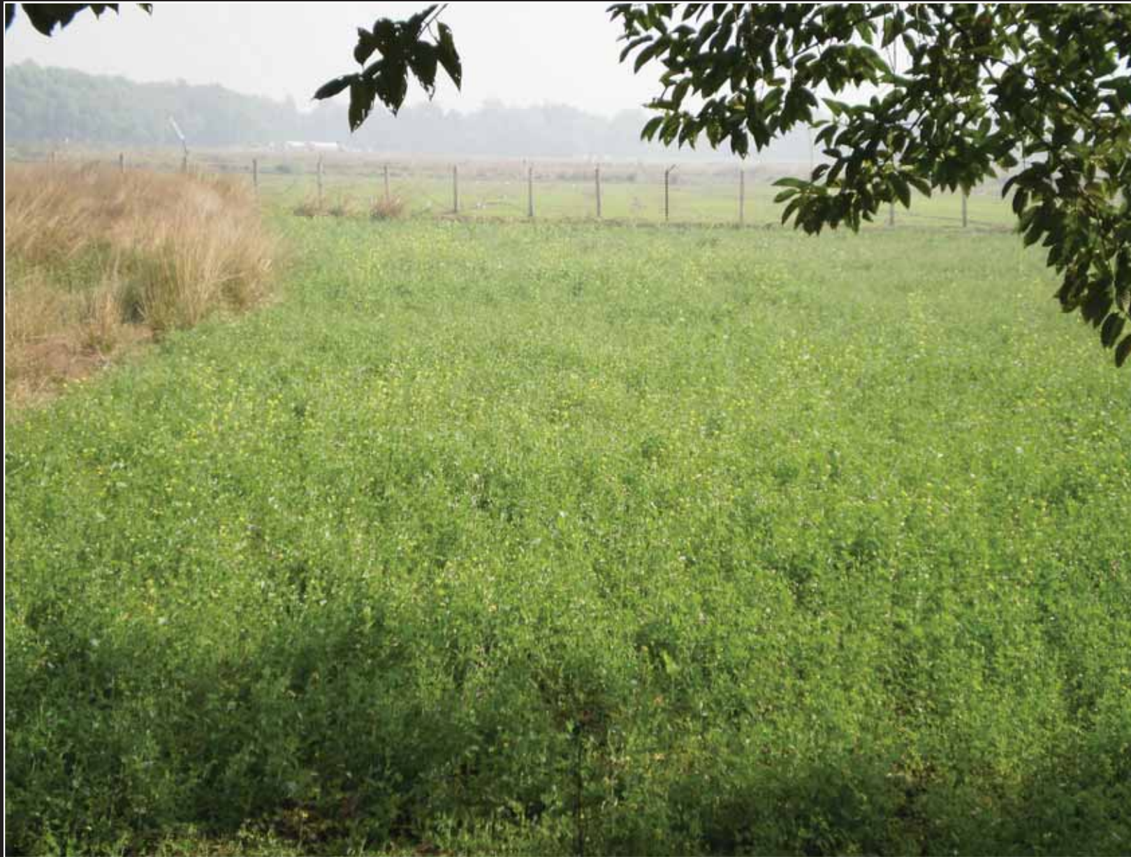
No. 39 Title: Future of my Earth What is awaiting all of us....