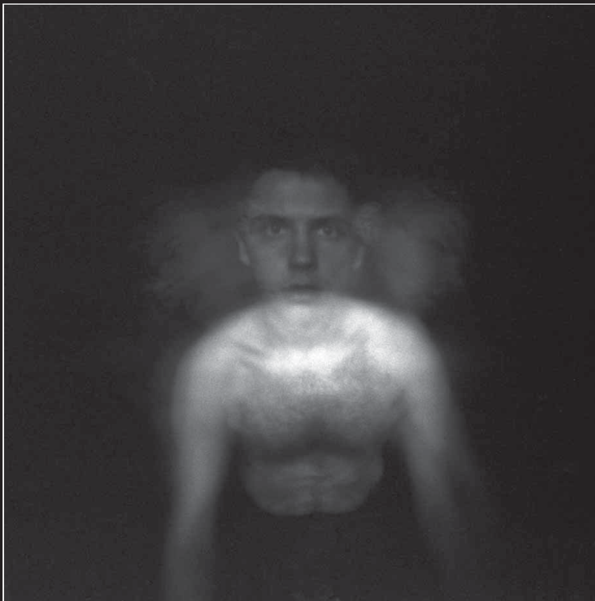
No. 31 Title: He! Shot in Wroclaw, Poland