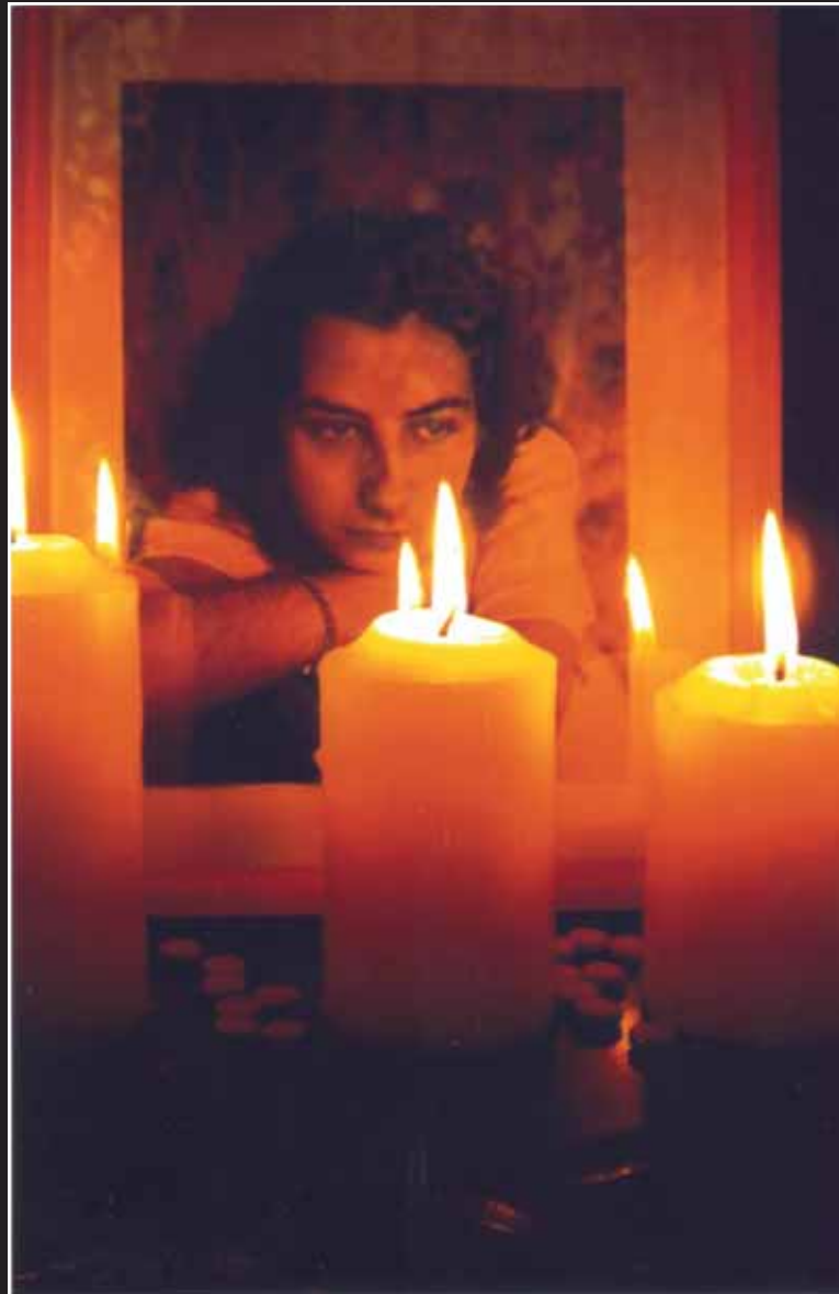
No. 41  Title: Sunshine after the rain Shot in Longford, Ireland