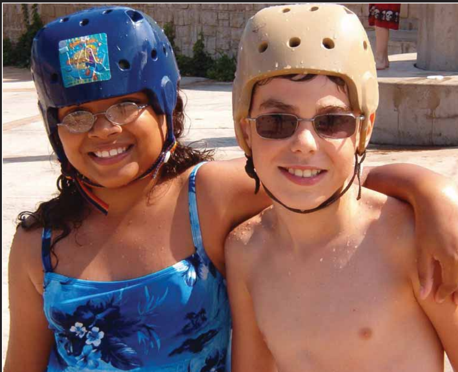
No. 42 Title: No Judgement, Just Smiles Two best friends having fun in summer camp