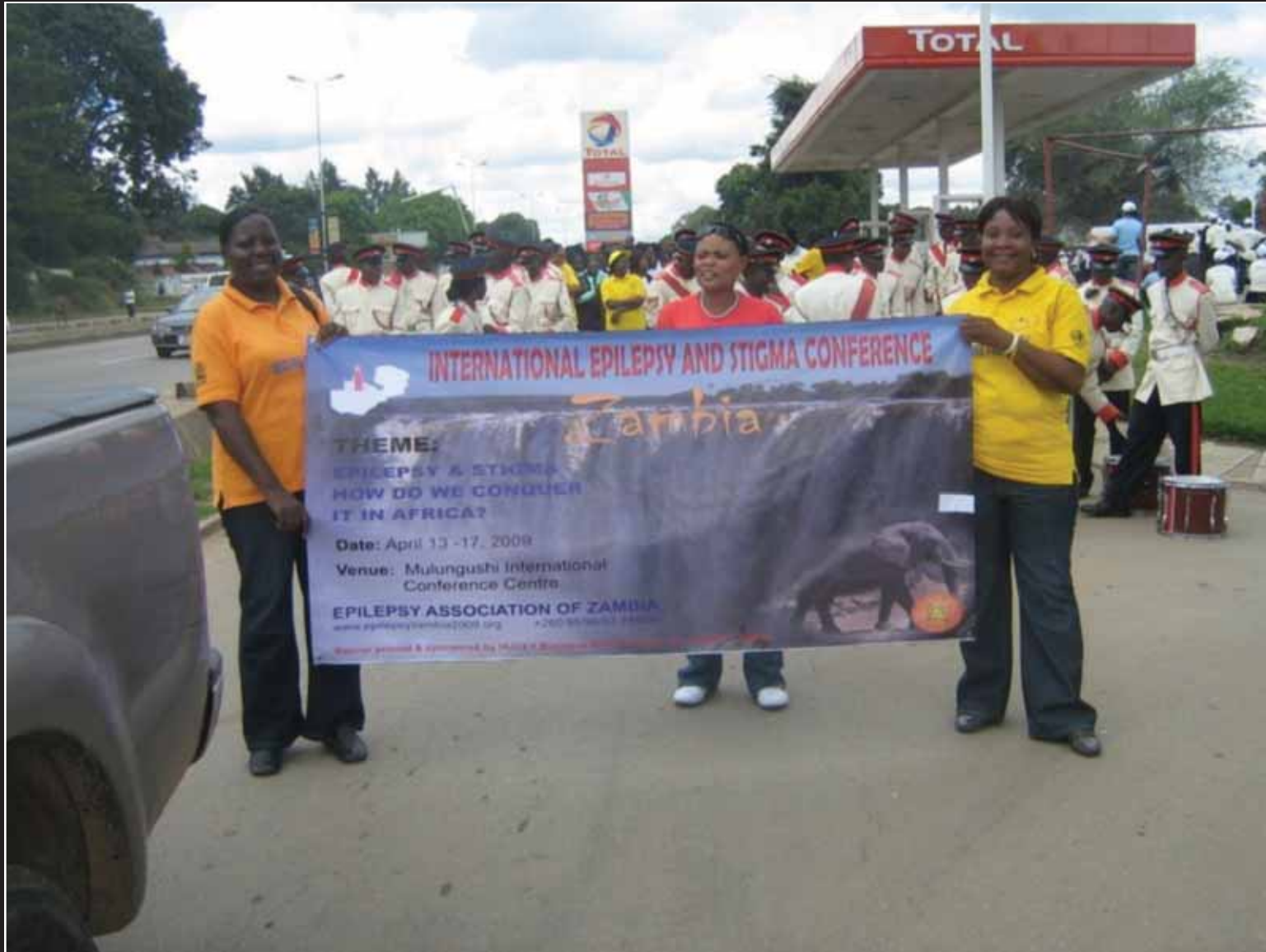
No. 45 Title: Happy Faces Two happy people with epilepsy