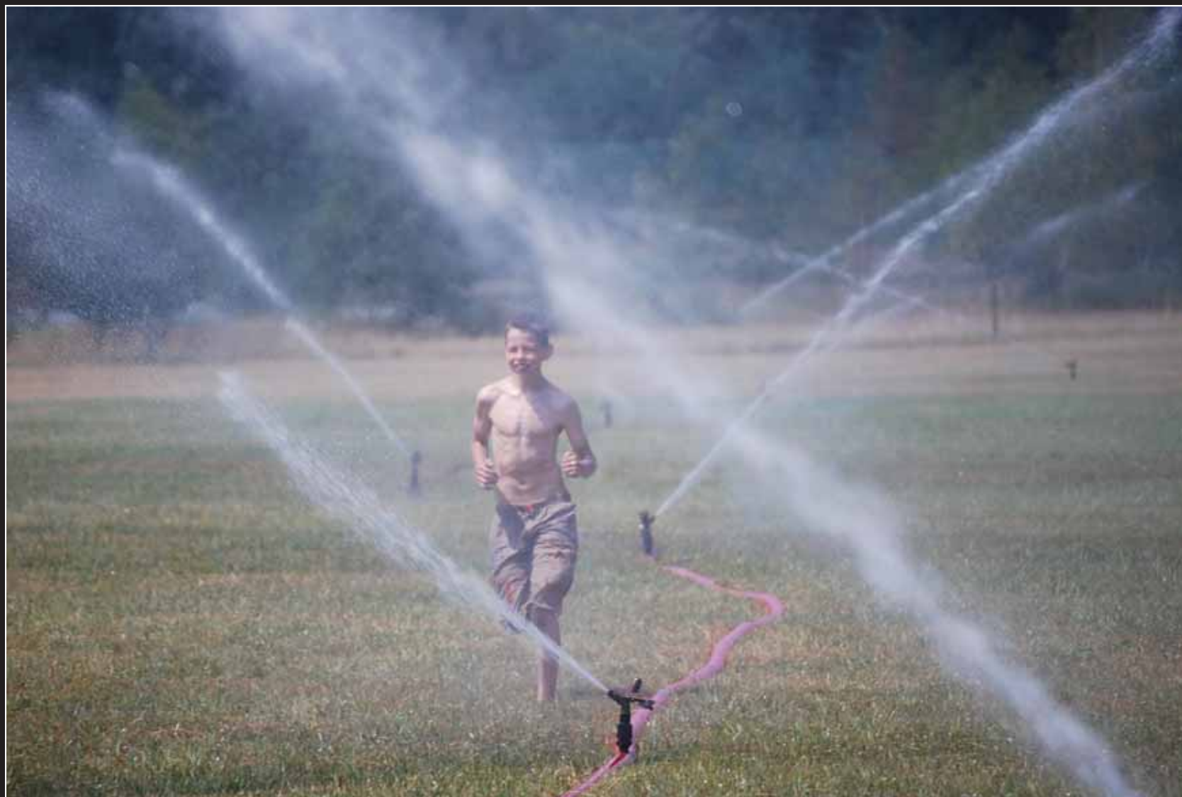
No. 44 Title: Summer Rain I'm seizure-free