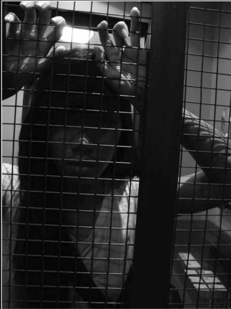
No. 57 Title: Wordless Struggle Shot in Singapore