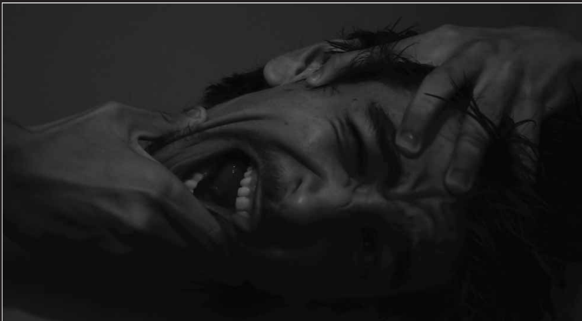
No. 43 Photographer: Basem Nabhan, Syria Title: Scream An inner self trying to get out