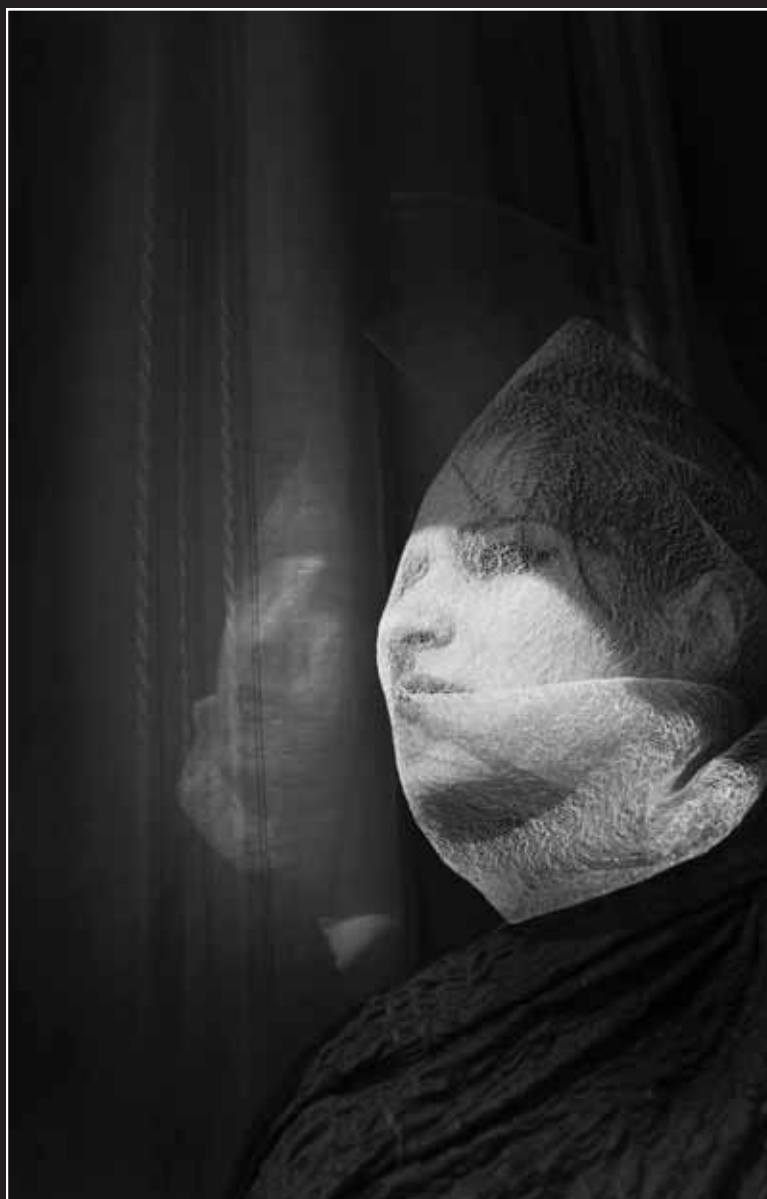
No. 55 Title: Reflection of my feelings My own reflection in a world without bad things.