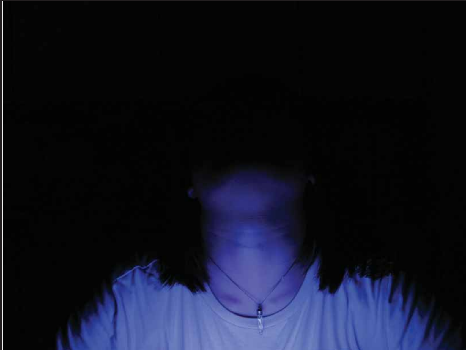
No. 58 Title: Out of our sight Shot in Singapore