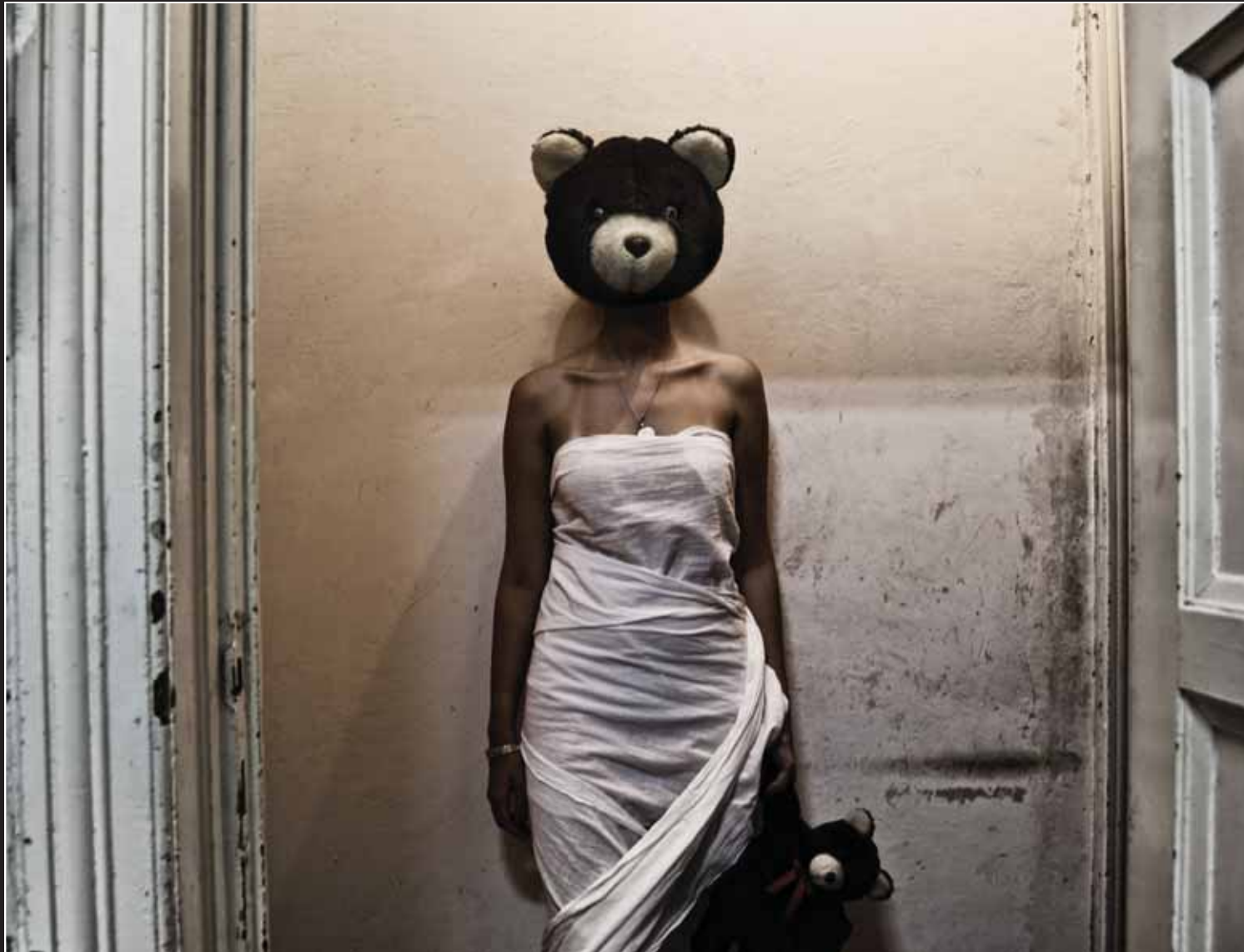
No. 59 Title: Female projection Showing the difference