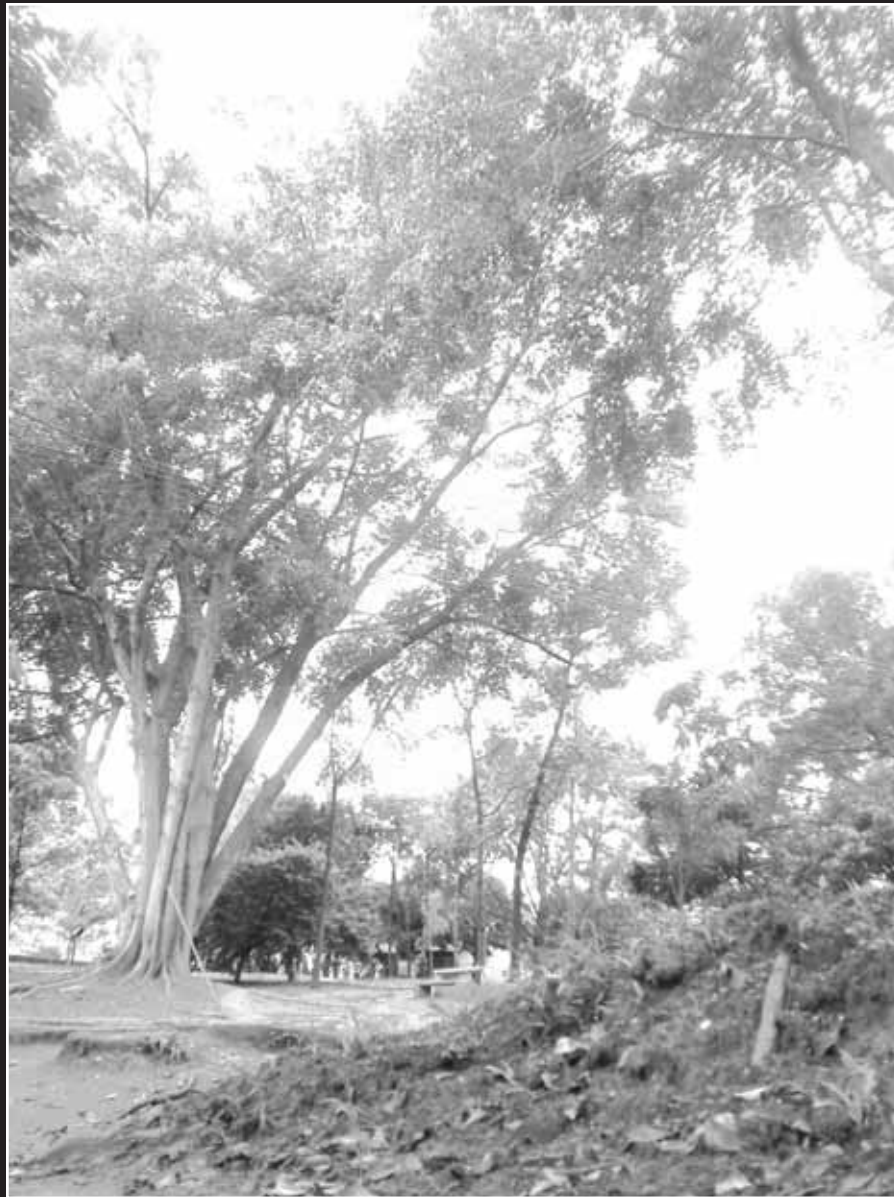
No. 52 Title: Having seizure in a faraway black & white sky Square of vision during a seizure