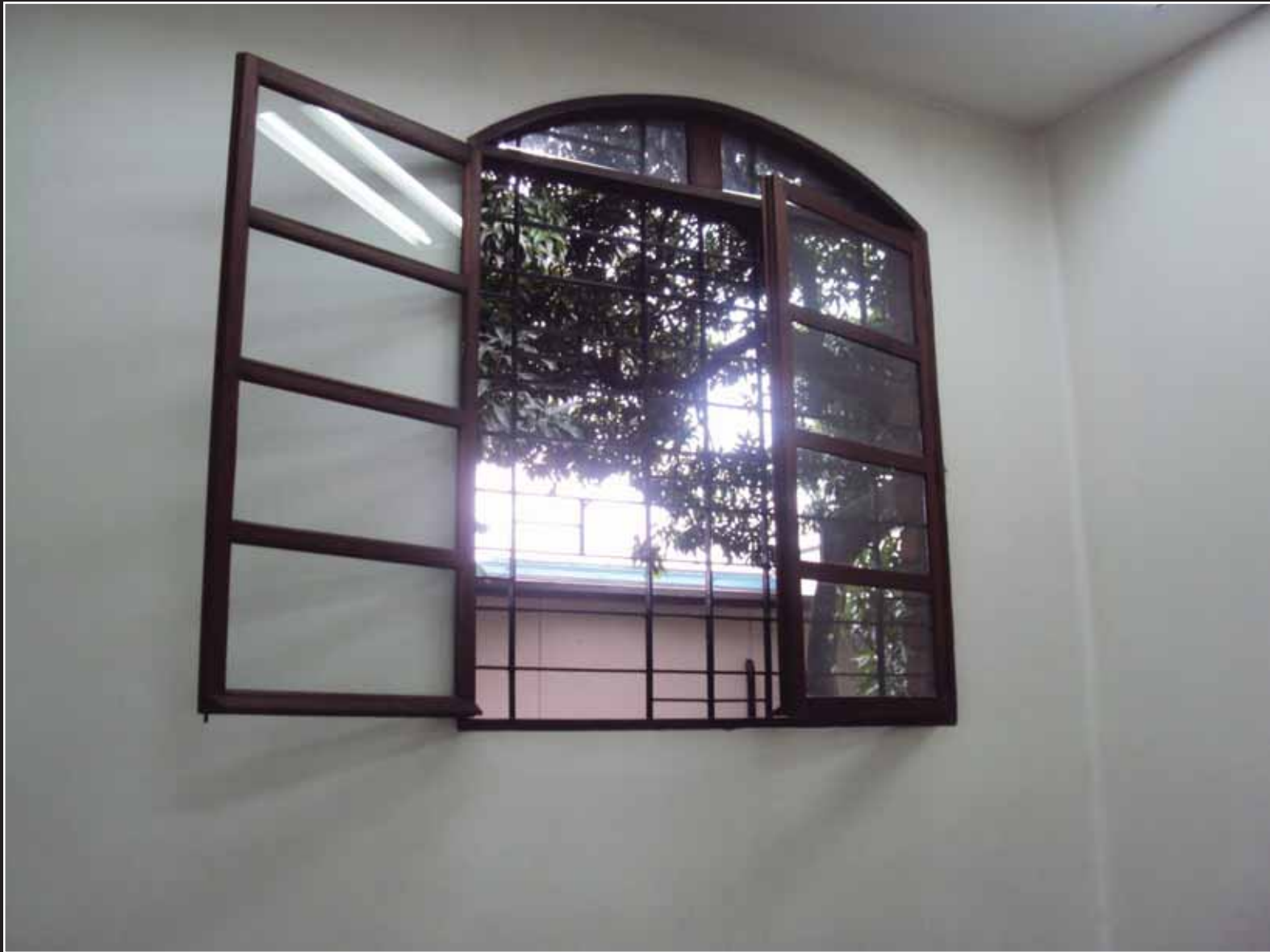
No. 50 Photographer: Blaire Ortiz, Colombia Title: Epilepsy across a window Behind a better side of life, facing stigma