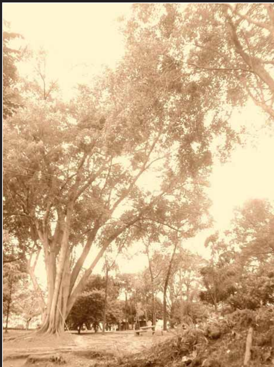
No. 49 Photographer: Blaire Ortiz, Colombia Title: Having seizure in a faraway yellow sky Square of vision during a seizure