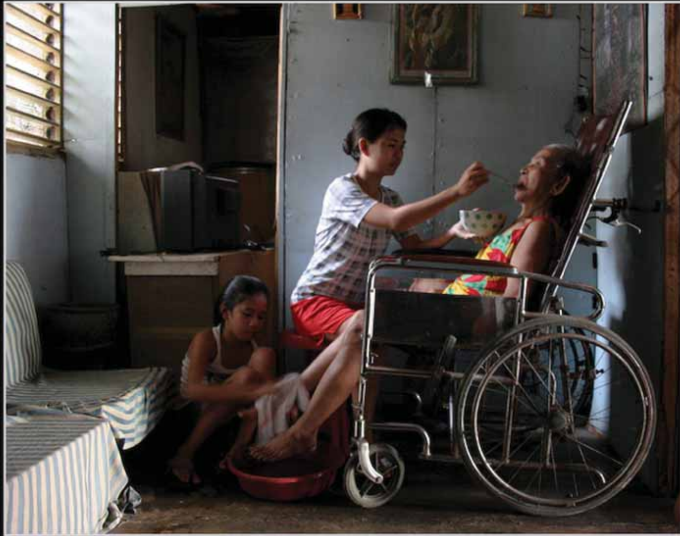
No. 53 Title: We care for you Shot in the Philippines