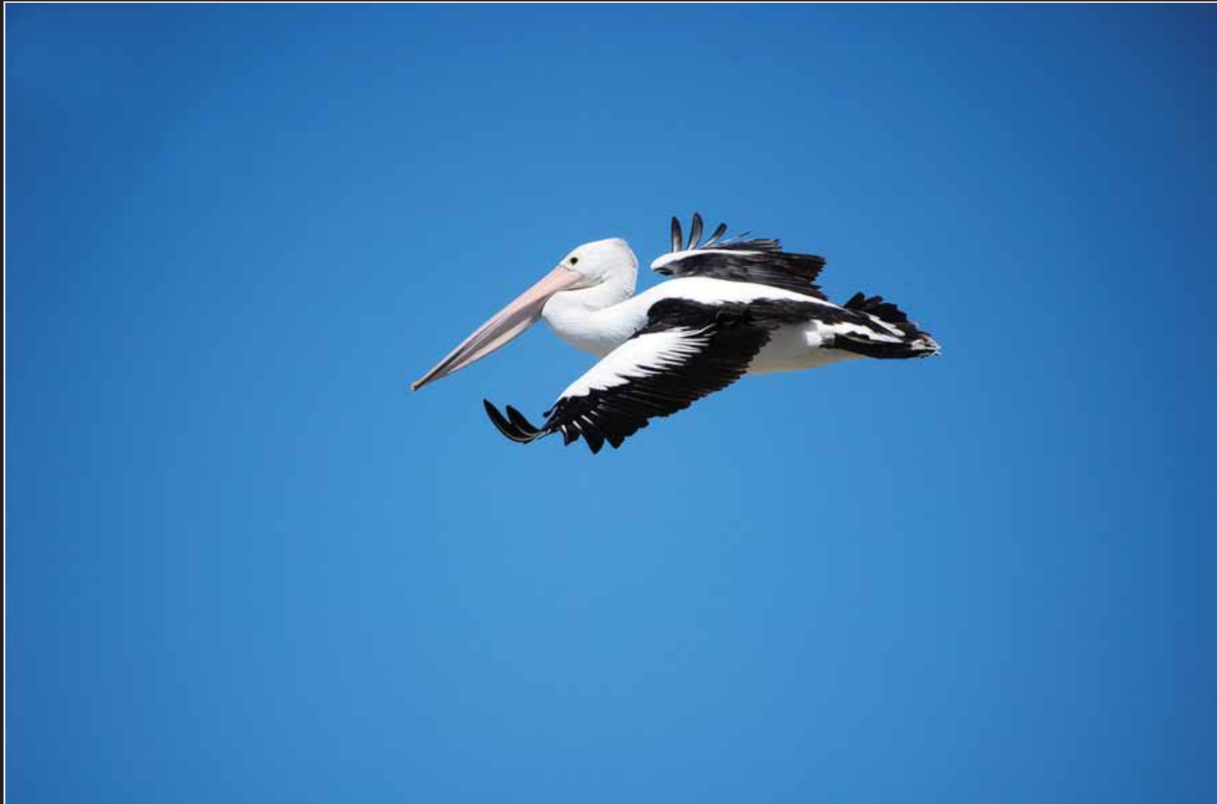
No. 60 Title: Freedom and Hope Hope to find freedom from epilepsy