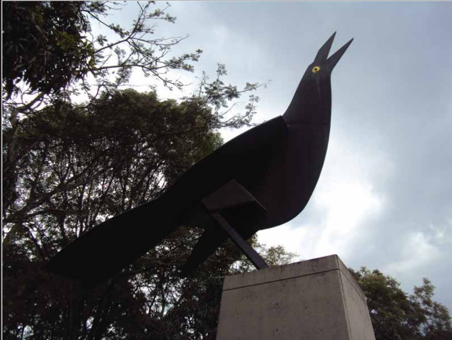
No. 47 Title: Seizures of a Great-tailed Grackle Shot in San Vicente Hospital Foundation, Colombia