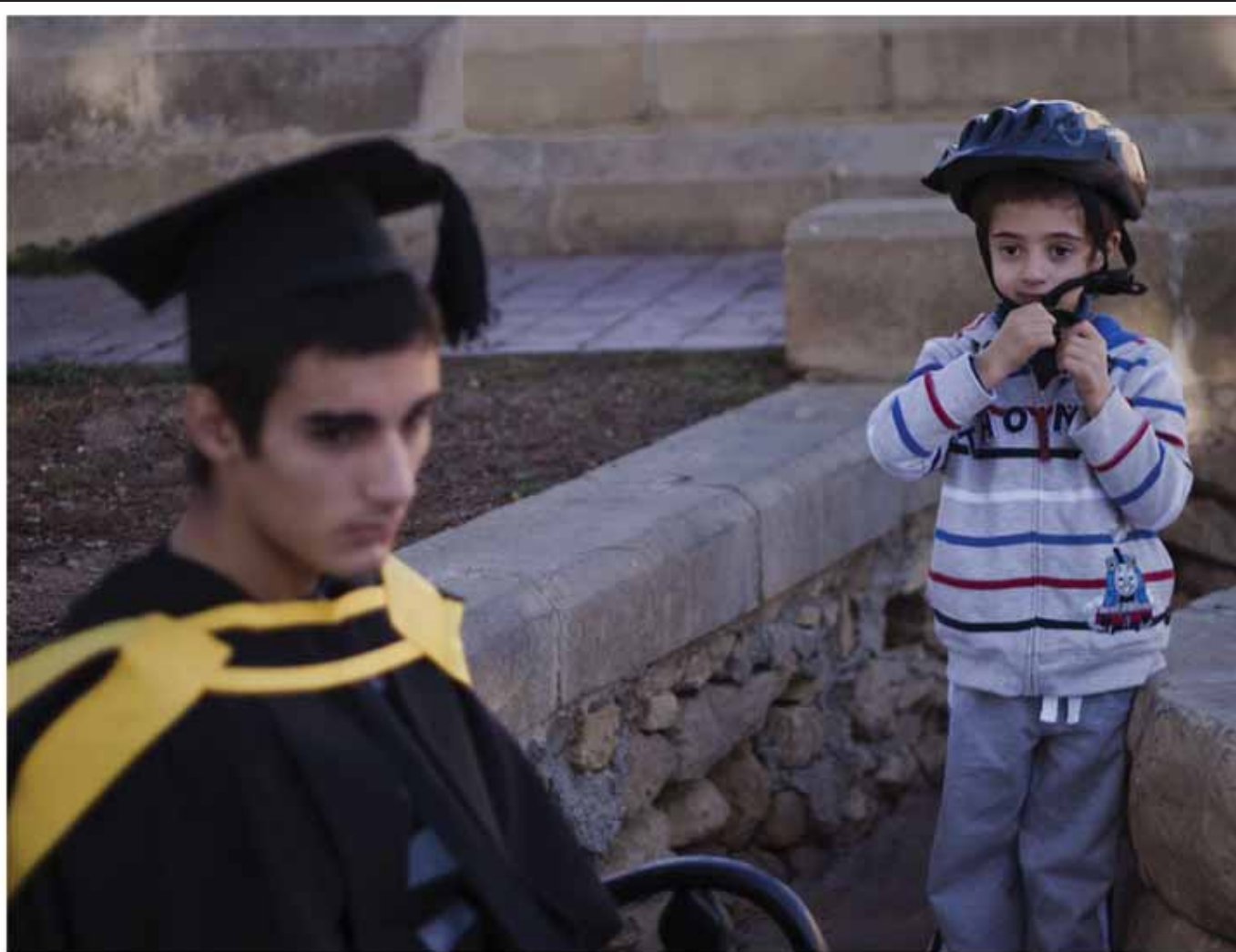
Epilepsy is Not a Barrier

No. 88 Title: Epilepsy is Not a Barrier The child that became a graduate. Don't let epilepsy stop you from reaching your goals.