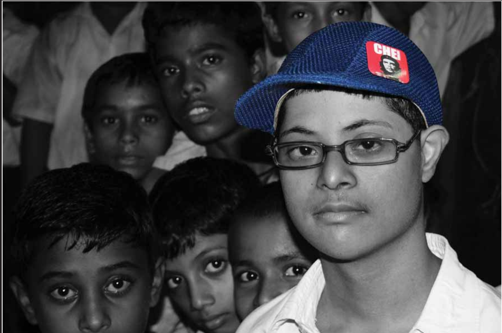
No. 83 Title: The fighter Shot in Kolkata, India