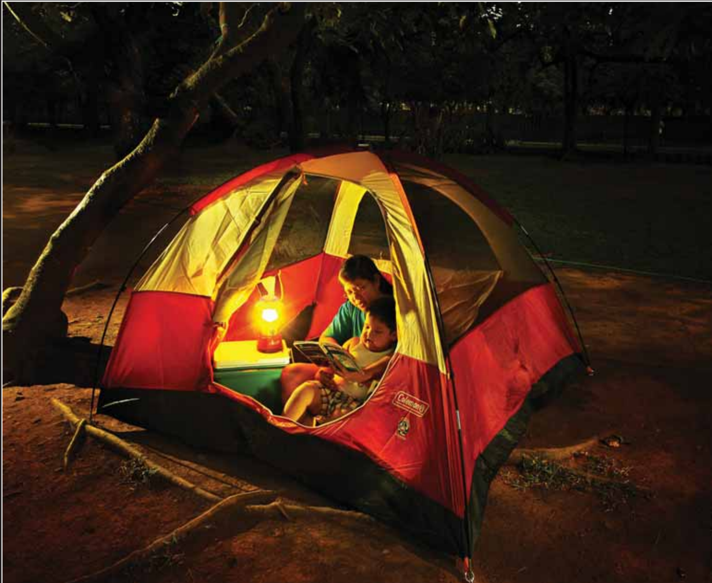
No. 81 Title: Unwavering love Feel the unwavering love and family support.