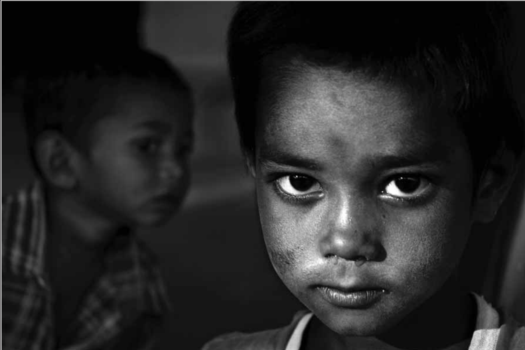
No. 87 Photographer: Dibyendu Dey Choughury, India Title: Bring the Smile back Shot in West Bengal, India