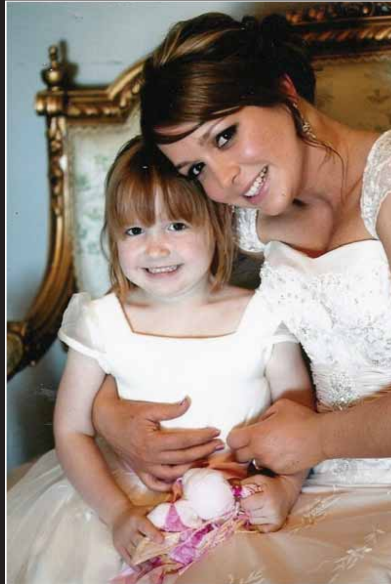
No. 90 Title: There's a light at the end of the tunnel My two daughters. This photo represents hope, love and life in spite of epilepsy.