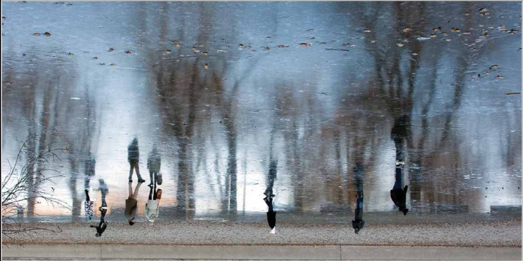
No. 97 Title: Reflections Shot in Montreal, Canada