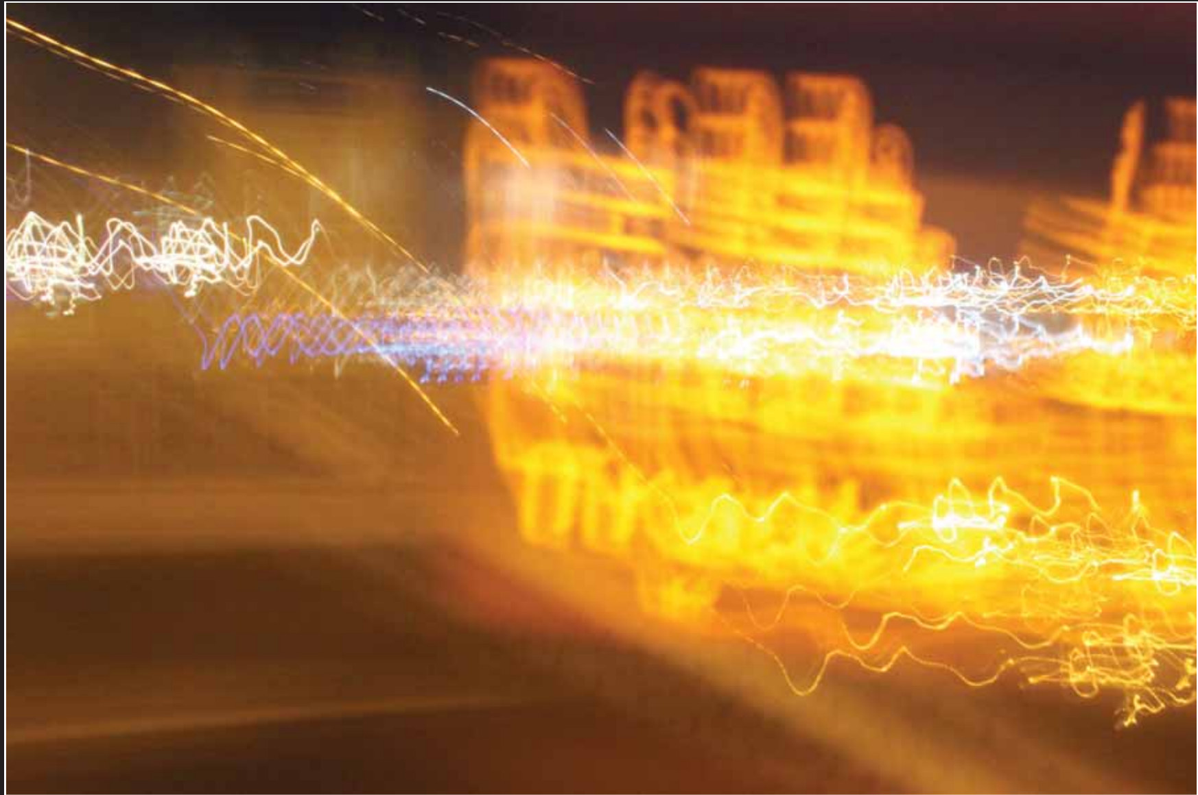
No. 84 Title: Triggers The idea of seizures triggered by certain situations such as flickering lights.