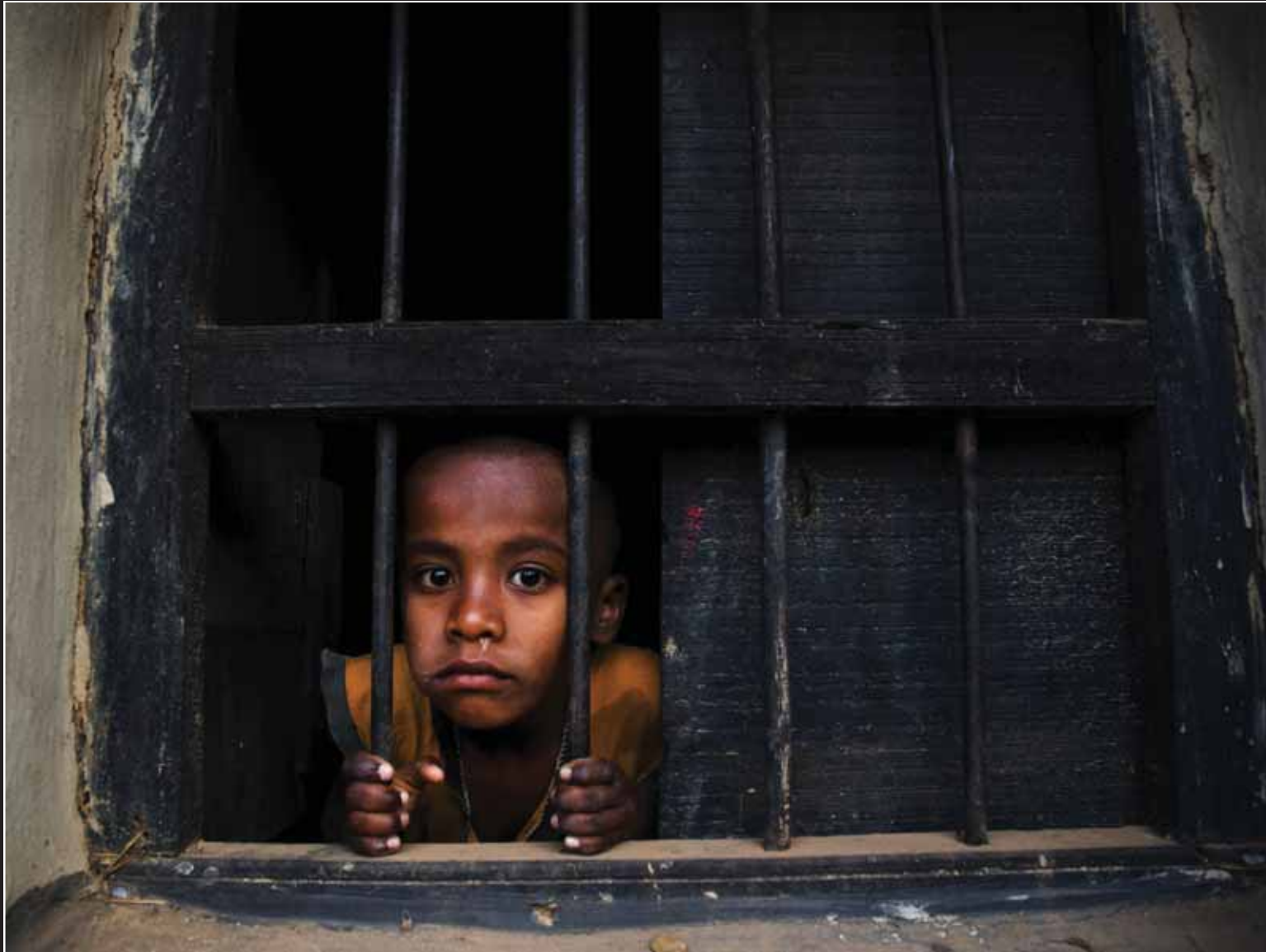
No. 85 Photographer: Dibyendu Dey Choughury, India Title: Without words Shot in West Bengal, India