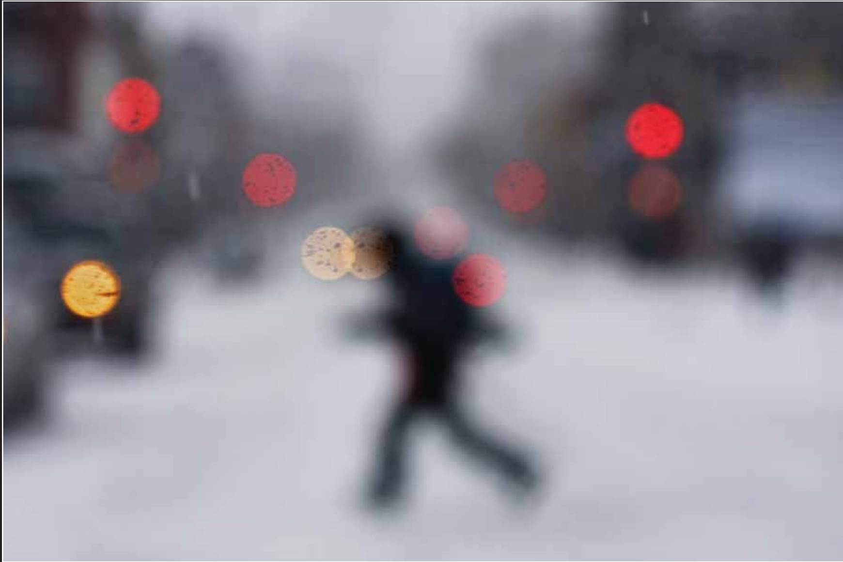
No. 94 Title: Pedestrian study Shot in Montreal, Canada