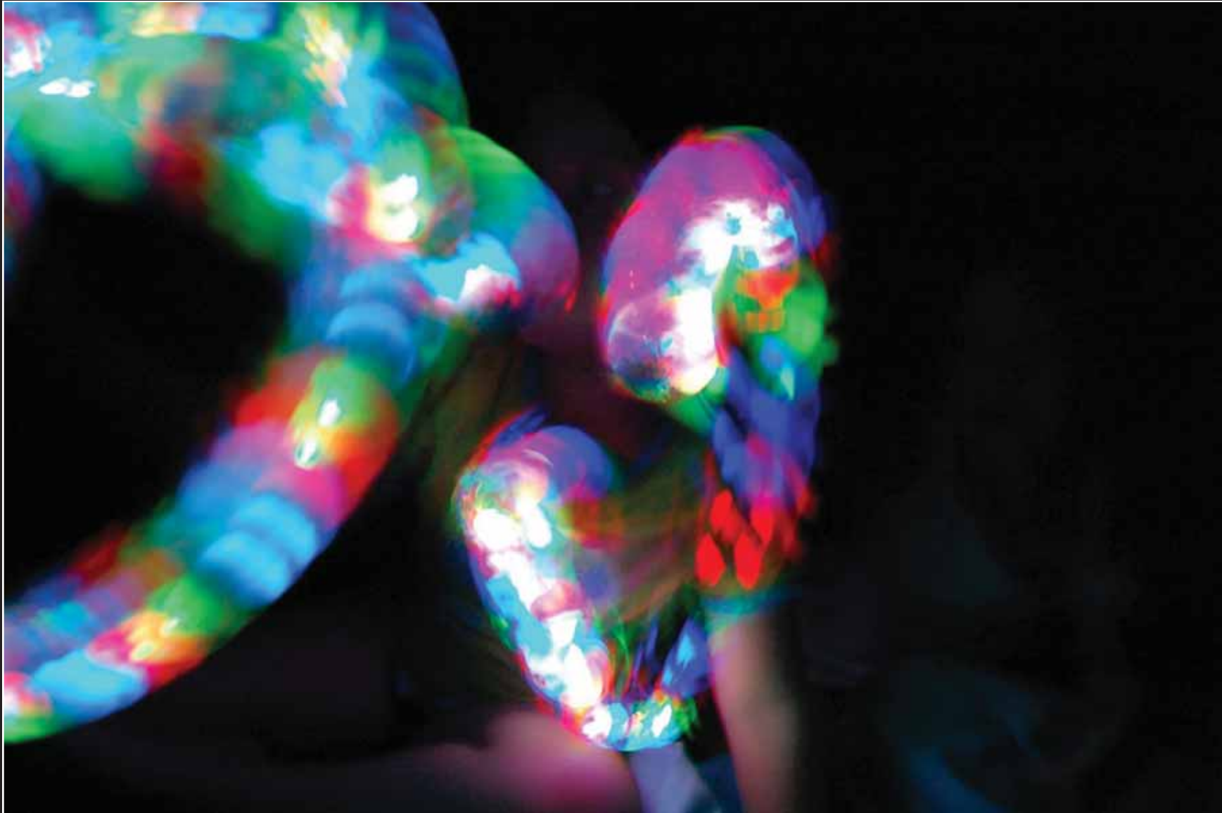
No. 89 Title: Epilectricute My two kids dancing and playing with their glow sticks.