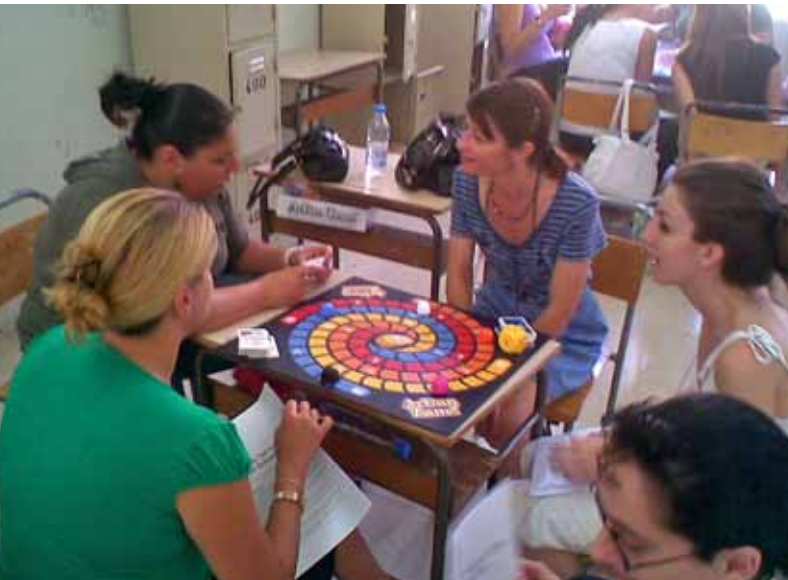
Teachers test their knowledge with 'Action Zone!'

The Lithuanian Association for the Integration of People with Epilepsy (LESIA) has completed an initiative "I am the Same as You", aimed at decreasing stigma in society. The impetus for this initiative came from a public opinion poll (1,000 adult respondents), which proved that there is still lack of information about epilepsy in society. The poll was also conducted in Lithuanian schools, with 990 pupils of various ages involved. The results showed that one