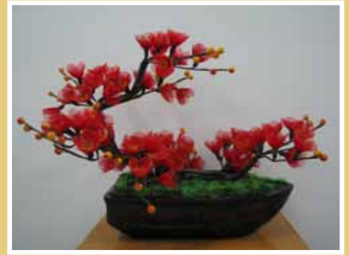
Stocking Fabric Cherry Blossom Ye Zhuang

important events in China, but also a reflection of her passion for life.