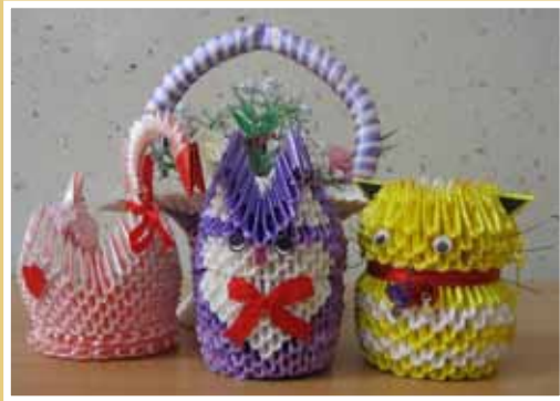
Origami Animals Li Tang