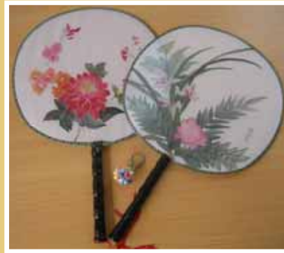
Chinese Painted Fans Xiaolan Tao