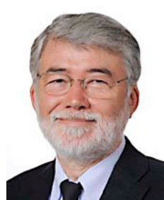
Sergio Gaetano COFFERATI