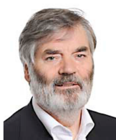
Proinsias DE ROSSA