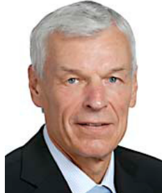
Justas Vincas PALECKIS