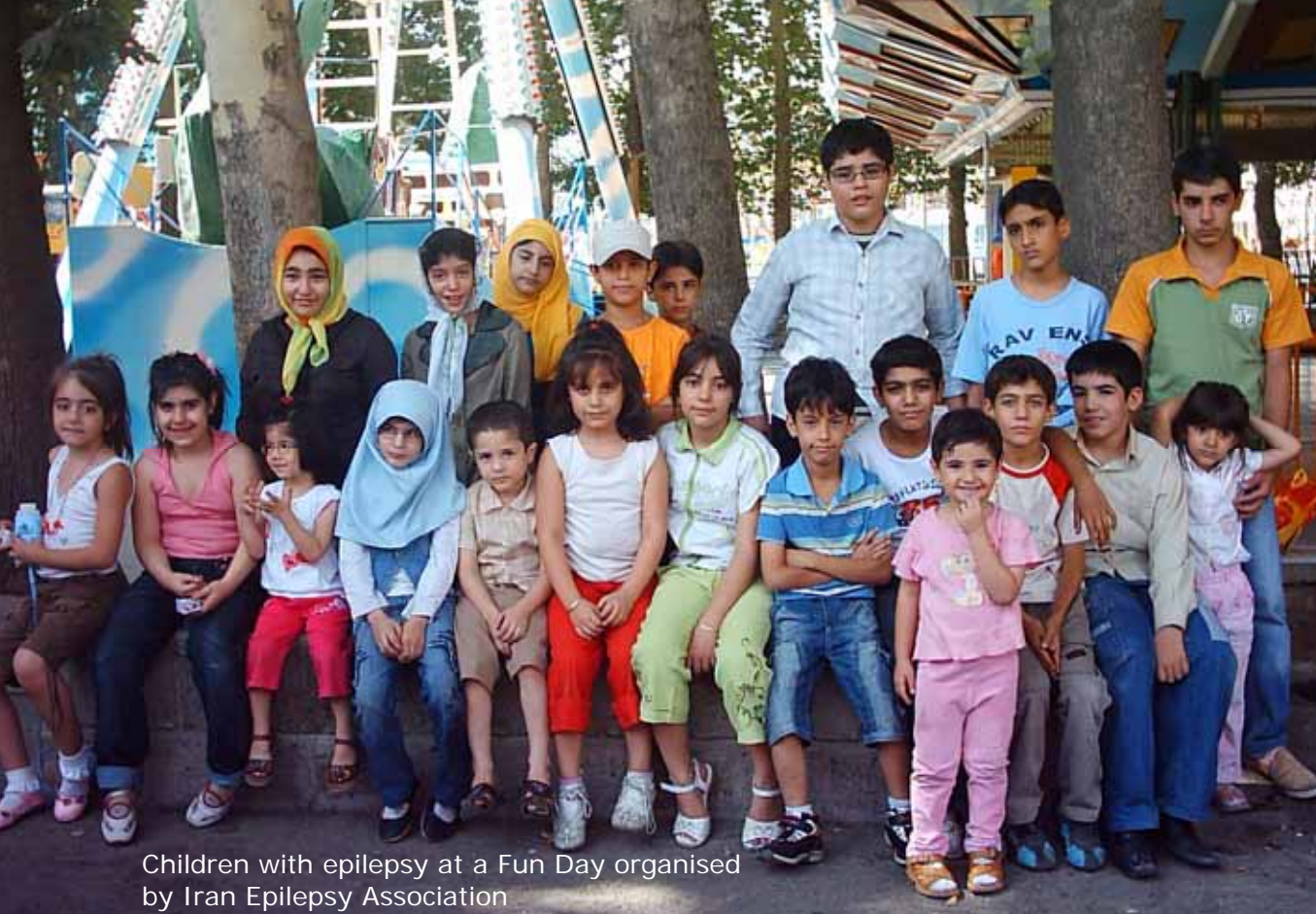
Children with epilepsy at a Fun Day organised by Iran Epilepsy Association