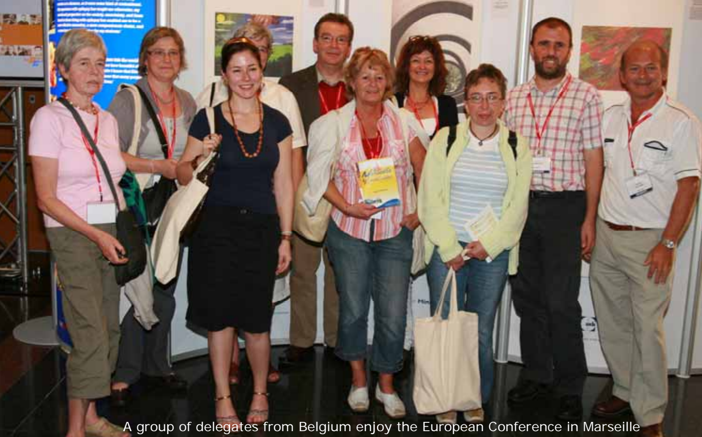
A group of delegates from Belgium enjoy the European Conference in Marseille