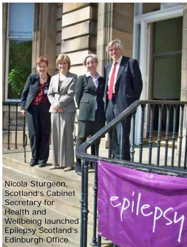
Nicola Sturgeon, Scotland's Cabinet Secretary for Health and Wellbeing launched Epilepsy Scotland's Edinburgh Office

Nurses, Better Epilepsy Care. There are just 24 specialist nurses to deliver care to the 40,000 people in Scotland who have epilepsy. Hundreds of people signed an electronic petition for more nurses on the Scottish Parliament’s website. Epilepsy Scotland also gave evidence to the Petitions Committee. The result to date is the employment of four more nurses since the campaign was launched in May 2008.