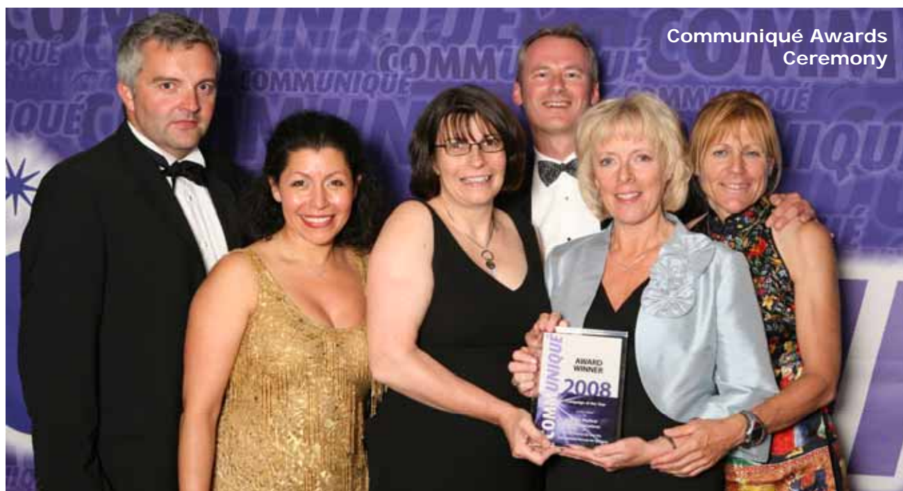
Communiqué Awards Ceremony

Nurses, Better Epilepsy Care. There are just 24 specialist nurses to deliver care to the 40,000 people in Scotland who have epilepsy. Hundreds of people signed an electronic petition for more nurses on the Scottish Parliament’s website. Epilepsy Scotland also gave evidence to the Petitions Committee. The result to date is the employment of four more nurses since the campaign was launched in May 2008.