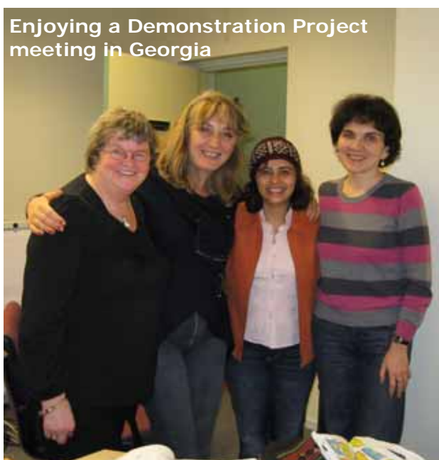
Enjoying a Demonstration Project meeting in Georgia