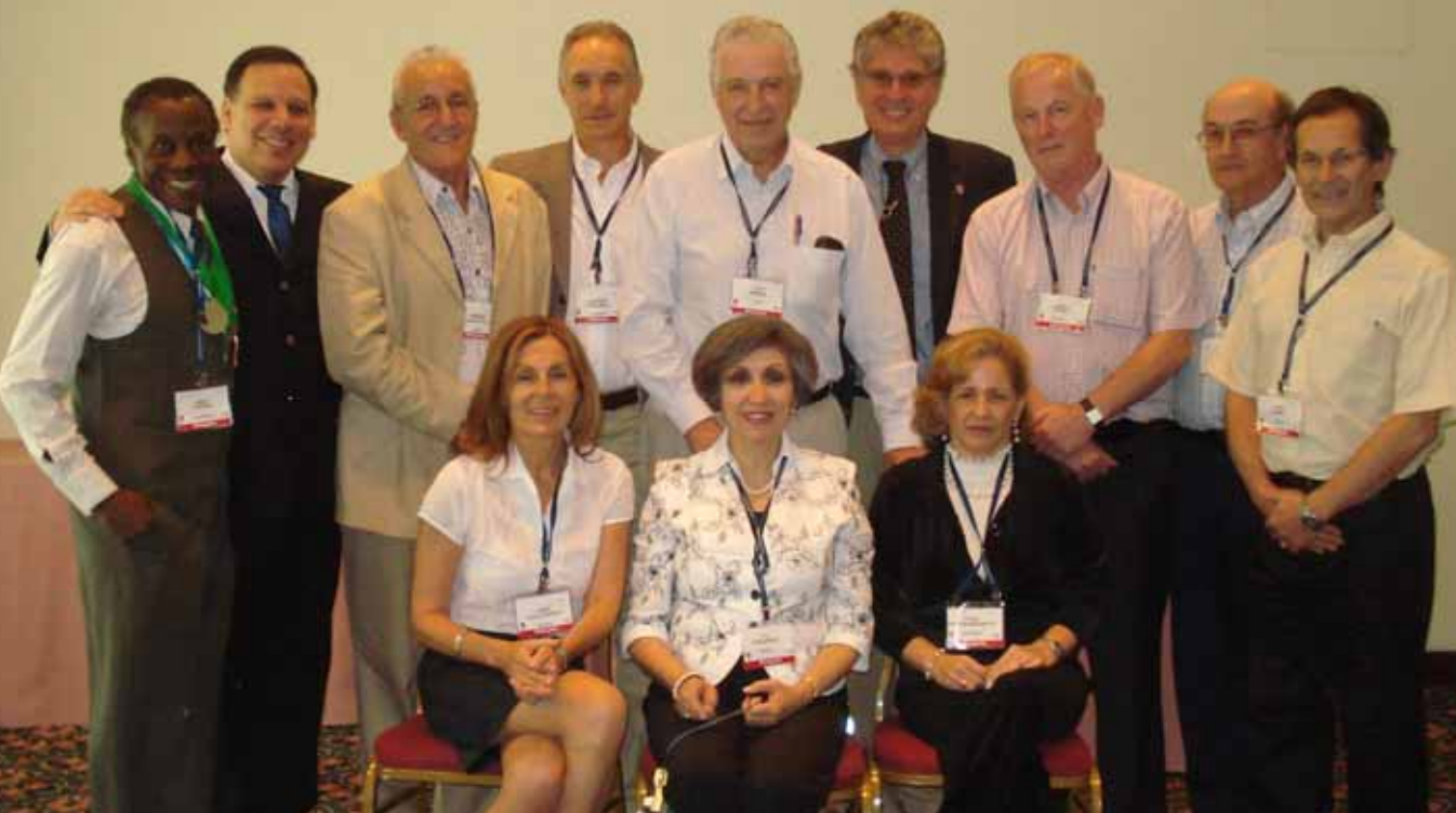
Delegates attending the joint meeting of the IBE Latin American Regional Committee and the ILAE Latin American Commission in Montevideo, Uruguay