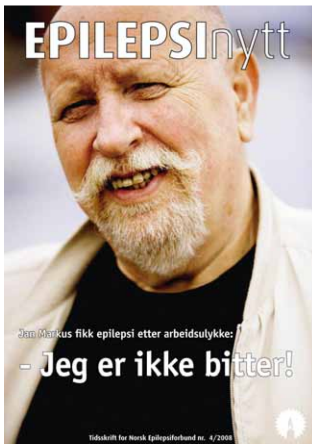
Poster of the Norwegian Epilepsy Association

program to improve the quality of life for people with epilepsy and their carers. MOSES has been used since 2006 with support from Bethel Epilepsy Centre (Germany). In 2008, 392 people received social rehabilitation services, including 31 children.