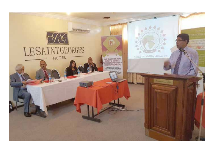
Le Saint Georges Hotel - Business and Corporate Workshop