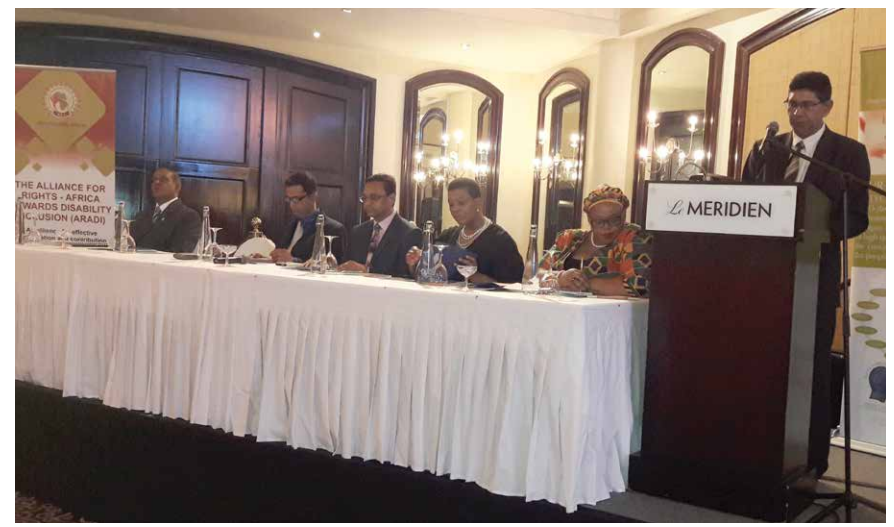
Le Meridien Hotel - Multi-Stakeholders Workshop