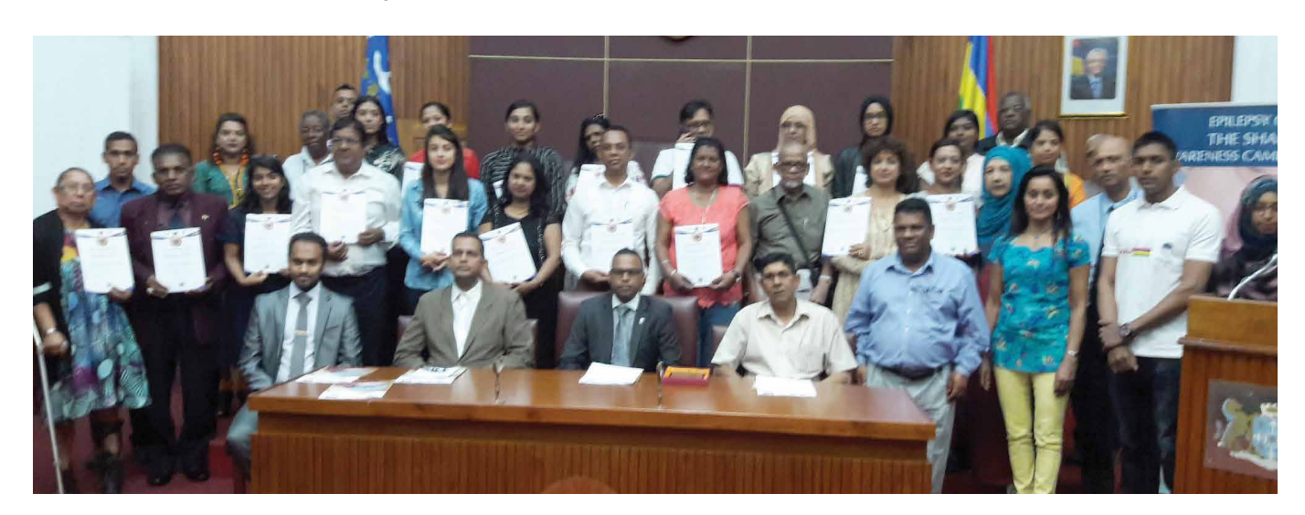
Official Launching of Edycs ARADI Advocacy Group - Mauritius