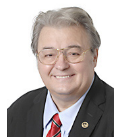
Corneliu VADIM TUDOR