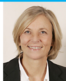
Marielle DE SARNEZ