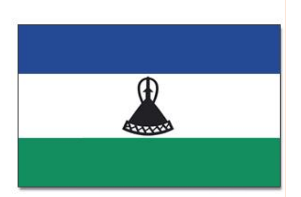
Image (right): Flag of Lesotho. Lesotho Epilepsy association was approved as an Associate Member of the IBE recently. Welcome to the family.