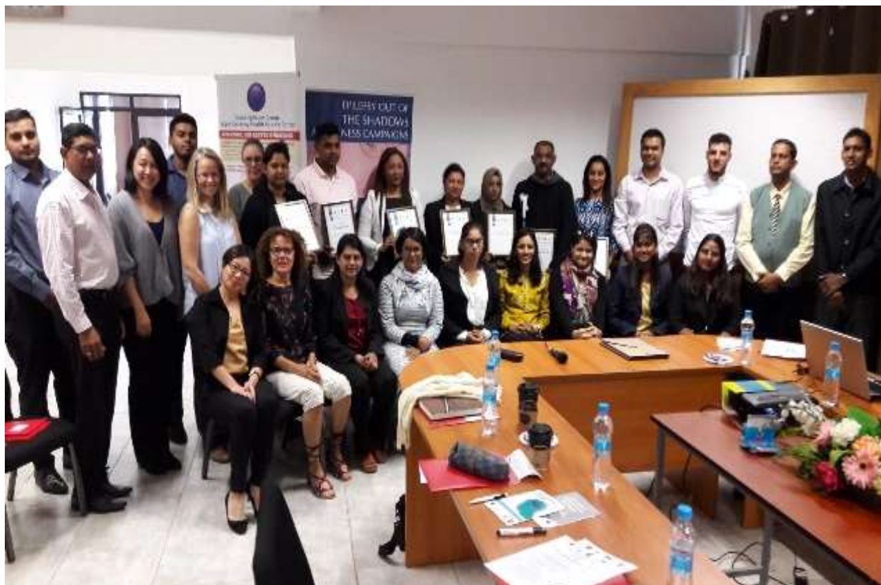
Cover Picture: Participants at the Epilepsy and Seizure Disorder Management Workshop, Mauritius

A Newsletter of the African Regional Committee of the International Bureau for Epilepsy (IBE)