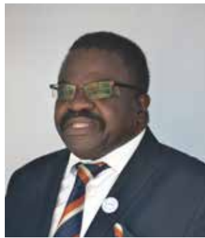
Action Amos VP Africa