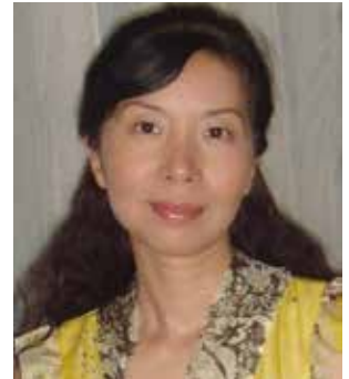
Ding Ding VP Western Pacific