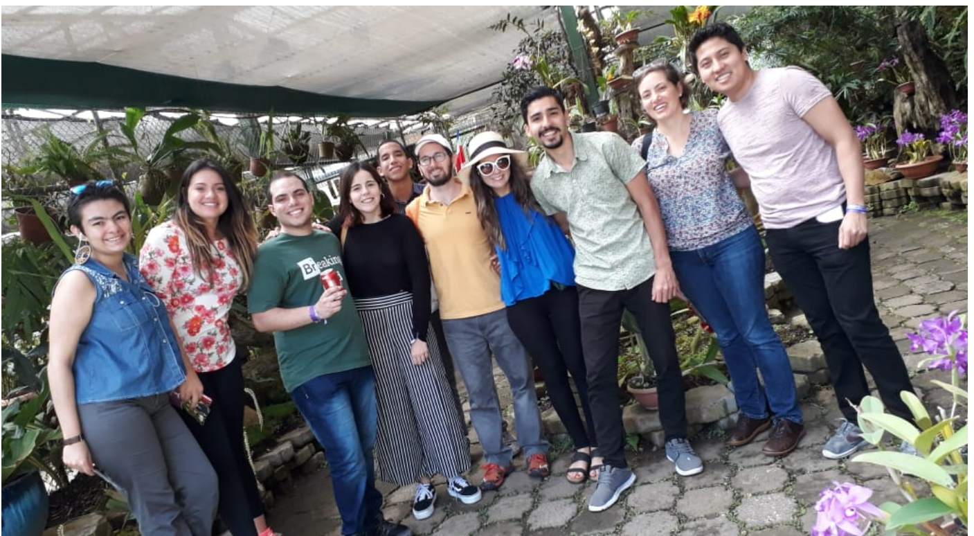
Photo: participants at the summit in Costa Rica.

The participants, from across the Latin American region deemed the event a great success. The next summit in the region is planned for Medellin, Colombia in 2020. Other summits will take place at the time of the other regional congresses as well as stand-alone events, the first being in Europe in 2019.