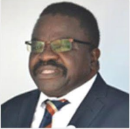
Vice-President, IBE Africa